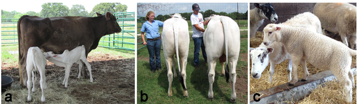
Fig. 2 MSTN edited animals. a The live born bull (bull #1: left) and heifer calf (right). b The readily observed phenotypic difference between bull #1 (right) and the wild-type heifer (left). c The edited lamb