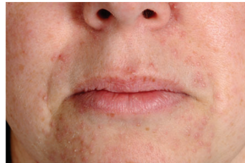
Figure 2 An example of the papulopustular (acneiform) rash experienced by some participants in response to treatment with oral gefitinib. The rash is most prominent in areas exposed to UV light, i.e. the face, neck and décolletage.

All participants promptly resumed their menstrual cycles (i.e. within 6 weeks of cure), and 3/8 so far have achieved a subsequent spontaneous