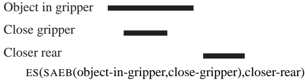
Figure 5. A bad fluent returned by the algorithm

The relationship between the clauses is accidental.