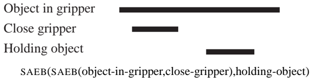
Figure 3. A learned fluent that indicates an action’s initial condition

The constituent fluent SAEB(\text{object-in-gripper}, \text{close-gripper}) was not significant; only about half the time that an object was between the gripper paddles did the robot happen to close the gripper.