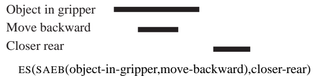
Figure 4. A marginal fluent returned by the algorithm

Bad fluents were those that seemed completely implausible. An example of a bad fluent the algorithm found is given in Figure 5. While the association between SAEB(\text{object-in-gripper}, \text{move-backward}) and closer-rear is significant, it does not correspond to any causal rule in the environment.