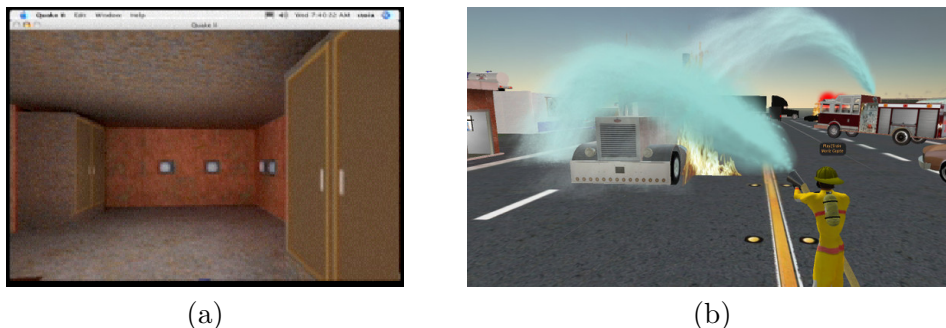
Figure 1: Sample virtual environments: (a) the Quake 2 engine used in [8], (b) a disaster response scenario in Second Life [2].

be evaluated. Then we will explain what aims we hope to achieve with this task, and what subcommunities might find it interesting. Finally, we will describe our plan for carrying out the first round of the challenge. Wherever appropriate, we will distinguish between the general VE setting and the concrete instruction giving task.