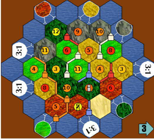
Figure 1: A game of Settlers in JSettlers .

future states non-deterministic, compelling players to assess the risk of their moves, including trading moves. A player’s decisions about what resources to trade depends on what he wants to build; e.g., a road requires 1 clay and 1 wood. Trading decisions are also determined by estimates of what will most advance, or undermine, the opponents’ strategies (Thomas, 2003). Players can also lose resources: e.g., a player who rolls a 7 can rob from another player. What’s robbed is hidden from view, so players lack complete information about their opponents’ resources. Because Settlers is a game of imperfect information, agents can, and frequently do, engage in ‘futile’ negotiations, which don’t result in any trade. An agent that initiates a negotiation that doesn’t result in a trade has in effect miscalculated the equilibrium strategies.