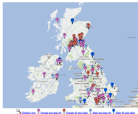
Figure 2: UK-wide speech database.

One of the key elements of the voice-banking project is the creation of a catalogue of healthy voices with a wide variety of accents and voice identities. This voice catalogue is used to create the average voice models for the speaker adaptation and to select the voice donors for the voice reconstruction. So far we have recorded about 500 healthy voice donors with various accents (Scottish, Irish, Other UK). This database is already the largest UK speech research database. An illustration of the geographical distribution of the speakers' birthplaces is shown on Figure 2. Each speaker has been recorded in a semi-anechoic chamber for about one hour using at each time a different script in order to get the best phonetic coverage on average. The database of healthy voices is first used to create the average voice models used for speaker adaptation. Ideally, the average voice model should be close to the vocal identity of the patient and it has been shown that gender and regional accent are the most influent factors in speaker similarity perception [14]. Therefore, the speakers are clustered according to their gender and their regional accent in order to train specific average voice models. A minimum of 10 speakers is required in order to get robust average voice models.