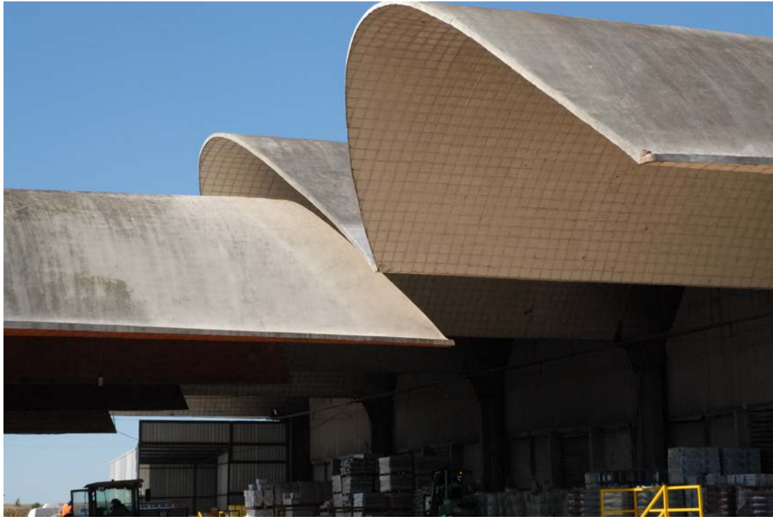
Figure 3 Agro-Industry Massaro, (R Pedreschi)