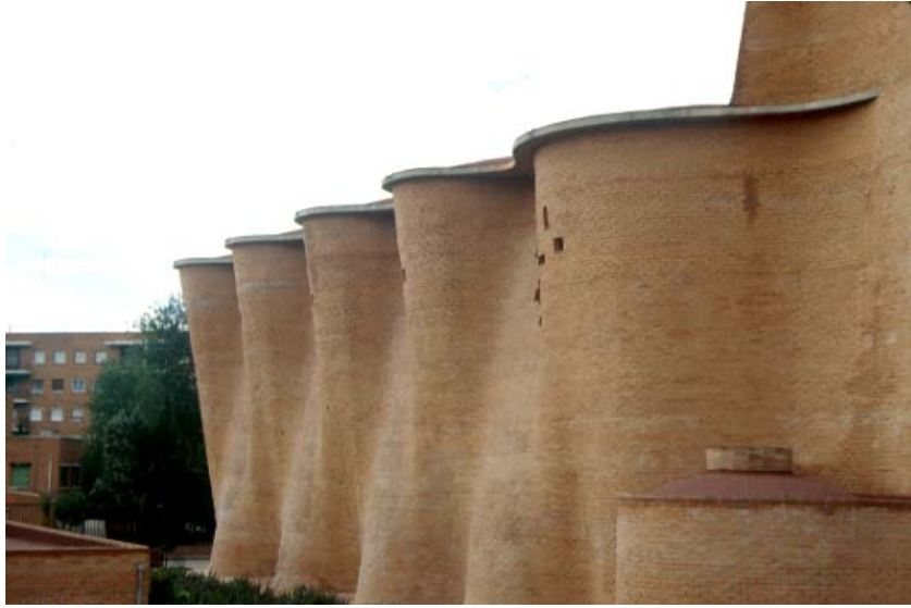
Figure 10, The Church of San Juan de Avila, Alacala de Henares, Spain, (R. Pedreschi)