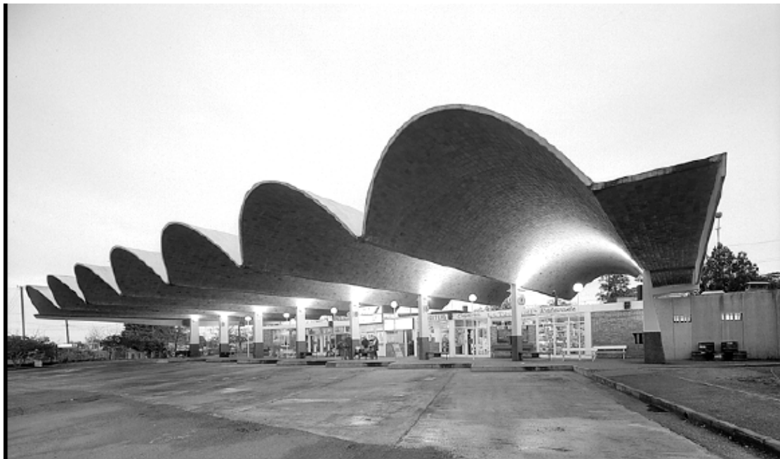
Figure 4 Bus Station at Salto, (Vincente del Amo)