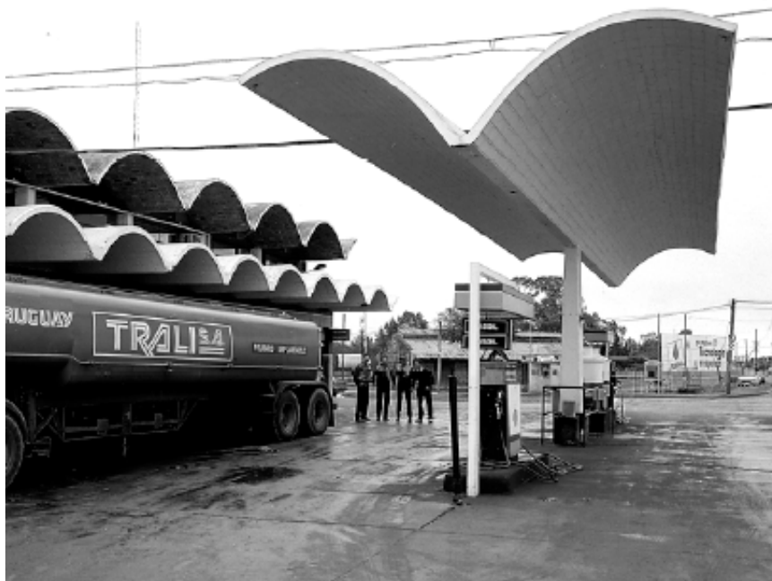
Figure 5 La Gaviota Salto, (Vicente del Amo)