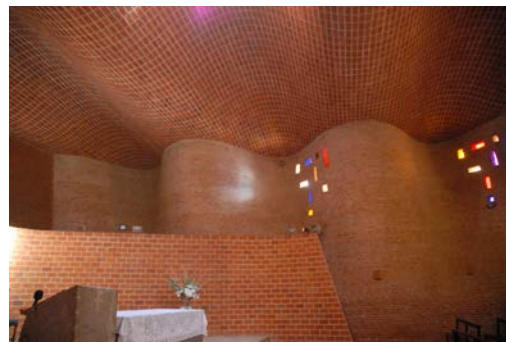
Figure 8 The Church of Jesus Christ the Worker, Atlantida, (R.Pedreschi)