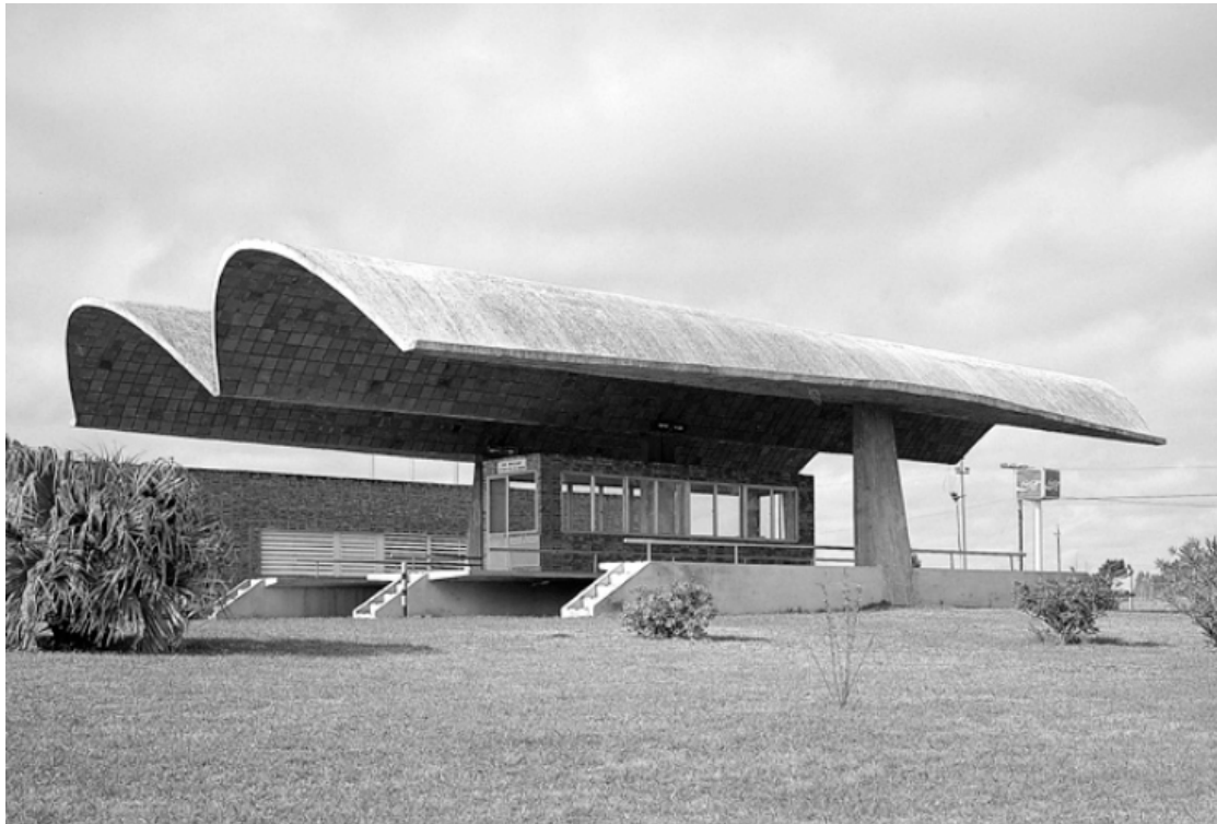
Fig.2 Free standing barrel vault, Refrescos Del Norte (Vincente del Amo)