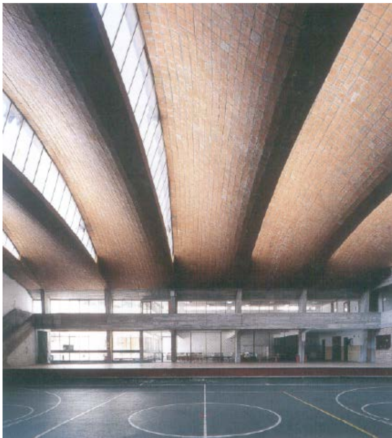
Figure 6 The Don Bosco Gymnasium, Montevideo, (R Pedreschi)