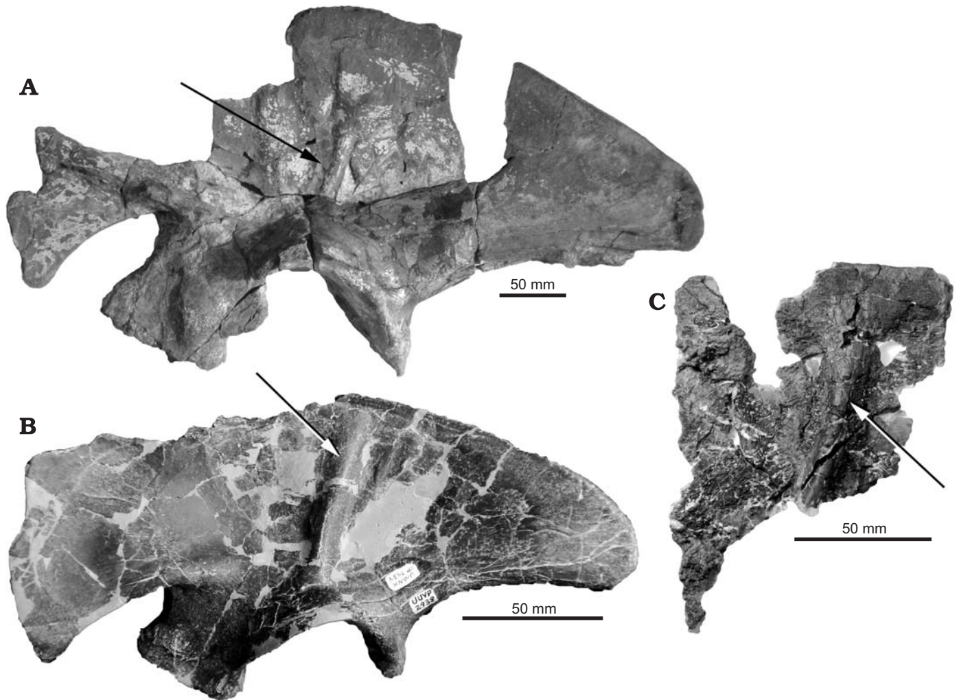
Fig. 1. Ili of basal non-tyrannosaurid tyrannosauroids with a posterodorsally inclined ridge on the lateral surface of the ilium. A. Right ilium (reversed) of Juratyran langhami Benson, 2008 (OUMNH J.3311-21), Kimmeridge Clay, Dorset England, Late Jurassic (early Tithonian). B. Left ilium of Stokesosaurus clevelandi , Madsen 1974 (UMNH VP 7473), Morrison Formation, Utah, USA, Late Jurassic (early Tithonian). C. Left ilium of Eotyrannus lengi Hutt, Naish, Martill, Barker, and Newberry, 2001 (MIWG 1997.550), Wessex Formation, Isle of Wight, England, Early Cretaceous (Barremian). All in lateral view. Arrows denote the lateral ridge.

this genus (Hutt et al. 2001) and has yet to be mentioned in the literature (MIWG 1997.550) (Fig. 1C). Although fragmentary, the specimen is identified as a left ilium because the base of one of the ventral peduncles is preserved, and it is mediolaterally narrow like the pubic peduncle of tyrannosauroids and other coelurosauroids but unlike the thicker and more conical ischial peduncle (e.g., Brochu 2003; Rauhut 2003b). A linear ridge is present, well preserved, and well developed on the lateral surface of the blade, and it extends strongly posterodorsally at approximately the same angle as seen in Stokesosaurus clevelandi and “ S. ” langhami . Therefore, a posterodorsally-inclined iliac ridge can no longer be considered as a unique synapomorphy of a monophyletic Stokesosaurus .