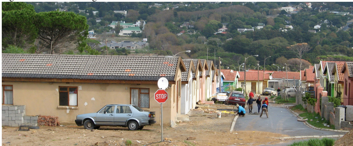
Figure 4: NMTT housing in Imizamo Yethu