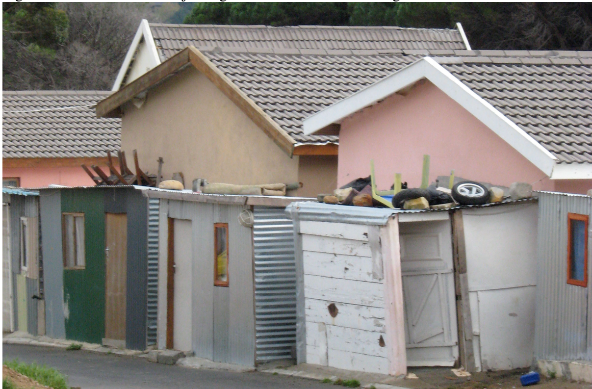
Figure 5: Informal shacks adjoining formalised NMTT housing.

Alongside these insights into health and well-being, shifts in community dynamics and tensions are apparent. While in-situ upgrades are designed to minimise community displacement and disruption, the partial and selective nature of this process enhances intra-community tensions. The backlog of housing needs means progress towards providing housing for all is slow, leaving shack dwellers with a sense of exclusion from progress towards the realisation of this right of citizenship. Misinformation and misunderstandings of the selection procedure for NMTT residents, internal political conflict and frustration with the slow pace of change contribute to a fracturing of community. While many are supportive of the formalisation of housing, and note how some individuals have used their new housing for community benefits (by hosting homework clubs and similar), there is frustration that many have not offered such support and opportunity to other community members. Such perceptions and feelings reflect and exacerbate the daily struggles to survive.