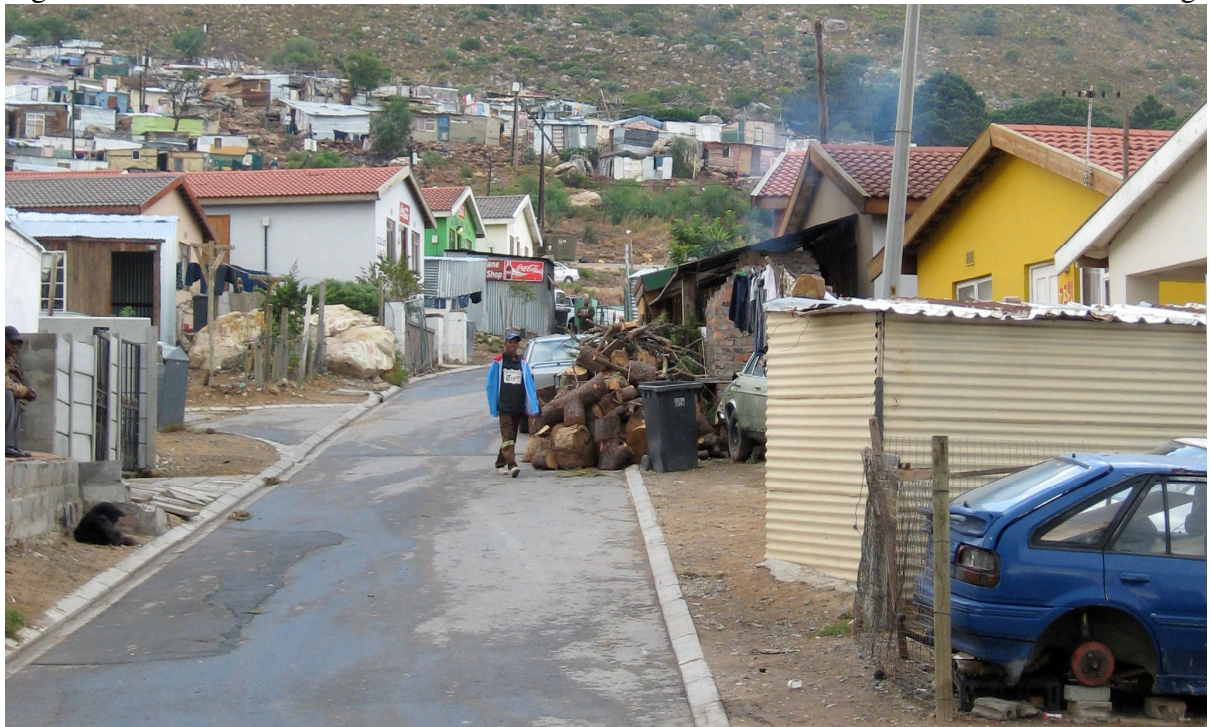
Figure 3: Evidence of home-based economic activities in formalised Imizamo Yethu housing

Overall, the settlement is marked by a lack of service provision, declining living conditions, environmental unsustainability and poverty (cf. Beall et al., 2000; Harte et al., 2008, p. 145). As Froestad (2005, p. 339) notes residents face a range of socio-economic, service delivery, environmental health and communicable disease challenges. The lack of formal planning means vehicular access is limited, structures are haphazardly laid-out and ‘plots’ are small with little or no outside space, which presents challenges to upgrade projects requiring larger plot sizes (cf. Mukhija, 2001). A significant proportion of residents have developed home-based enterprises - trading, shebeens, nurseries/crèches, hairdressing – in order to generate income (figure 3) (cf. Lizarralde & Massyn, 2008).