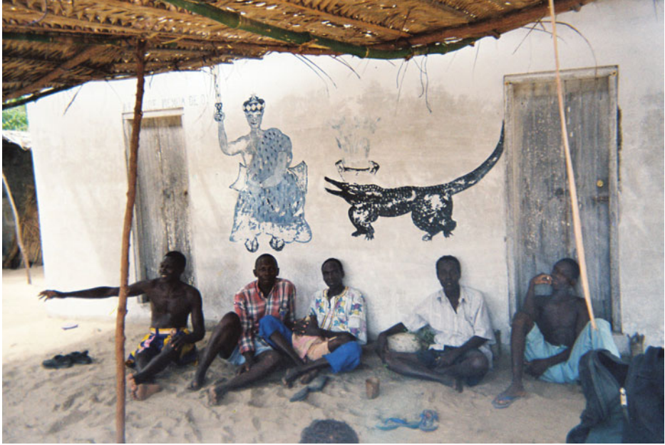
Fig. 2. A typical household shrine in Anlo-Afiadenyigba, belonging to a Fofie worshipping lineage that formerly owned slaves, depicting the divinities (both imagined and real) of the peoples they once enslaved (photo: Meera Venkatachalam, August 2005).