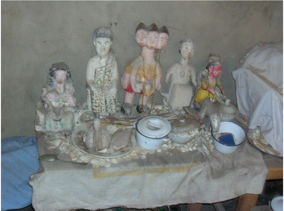
Fig. 3. Krachi Dente/Fofie shrine in Nyerwese (photo: Meera Venkatachalam, August 2003).