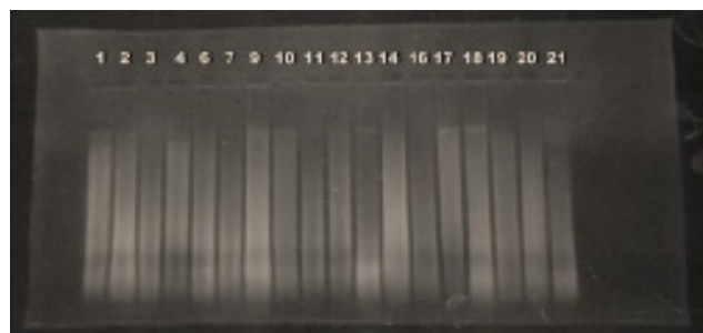
Figure 1. Result of DNA Band Visualization CTAB Method

Isolation of Rice DNA of local variety of South Sumatera using DNA method of Genomic DNA Purification System Kit from