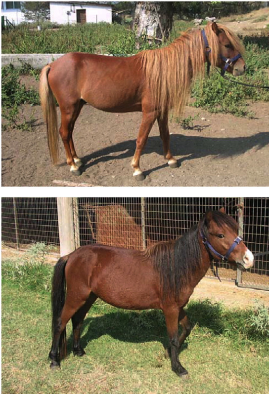
Fig. 1. Typical Skyros horses.

reproductive management of this population. To this date, the Skyros horse has not been studied genetically. Understanding the genetic background of the breed will increase its chances for survival.