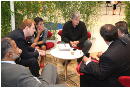
Fig. 2 (ESC 3704) Round table discussions at ESC

in an adjacent room on heart rhythm disturbances. Through the village concept the congress becomes more manageable and interactive. Important new guidelines will be presented at the ESC Congress 2013 on arterial hypertension,