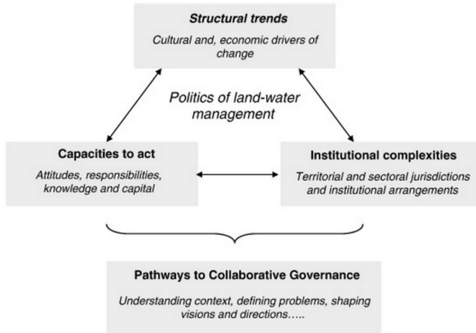
Figure 2. The thematic scope of social sciences research in IWAM..