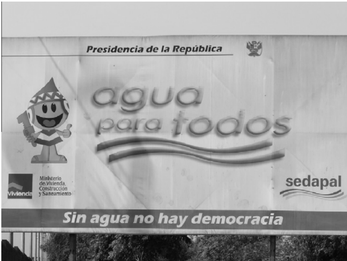
Figure 1. Advertisement of the Water for All Programme in Lima (picture taken outside the headquarters of SEDAPAL).

Despite its rhetoric of social inclusion and democratisation of services, APT offers an emblematic example of the barriers and difficulties to deal with the scarcity of water in Lima (without changes in current management practices). On the one hand, the initiative was evidently welcomed by construction companies and private operators, who were eager to praise the ‘leadership’ of the Peruvian government (for example, on 03 Dec 2011, there were 427 articles related to SEDAPAL on the website Business News America). 7 Such level of interest is not surprising given that most of APT works are to be carried out through concessions to and partnerships with private companies. On the other hand, the circumstantial abundance of investments made available by President García failed to conceal the uncertainties about the future of the water sector of Lima. The billionaire budget of the APT