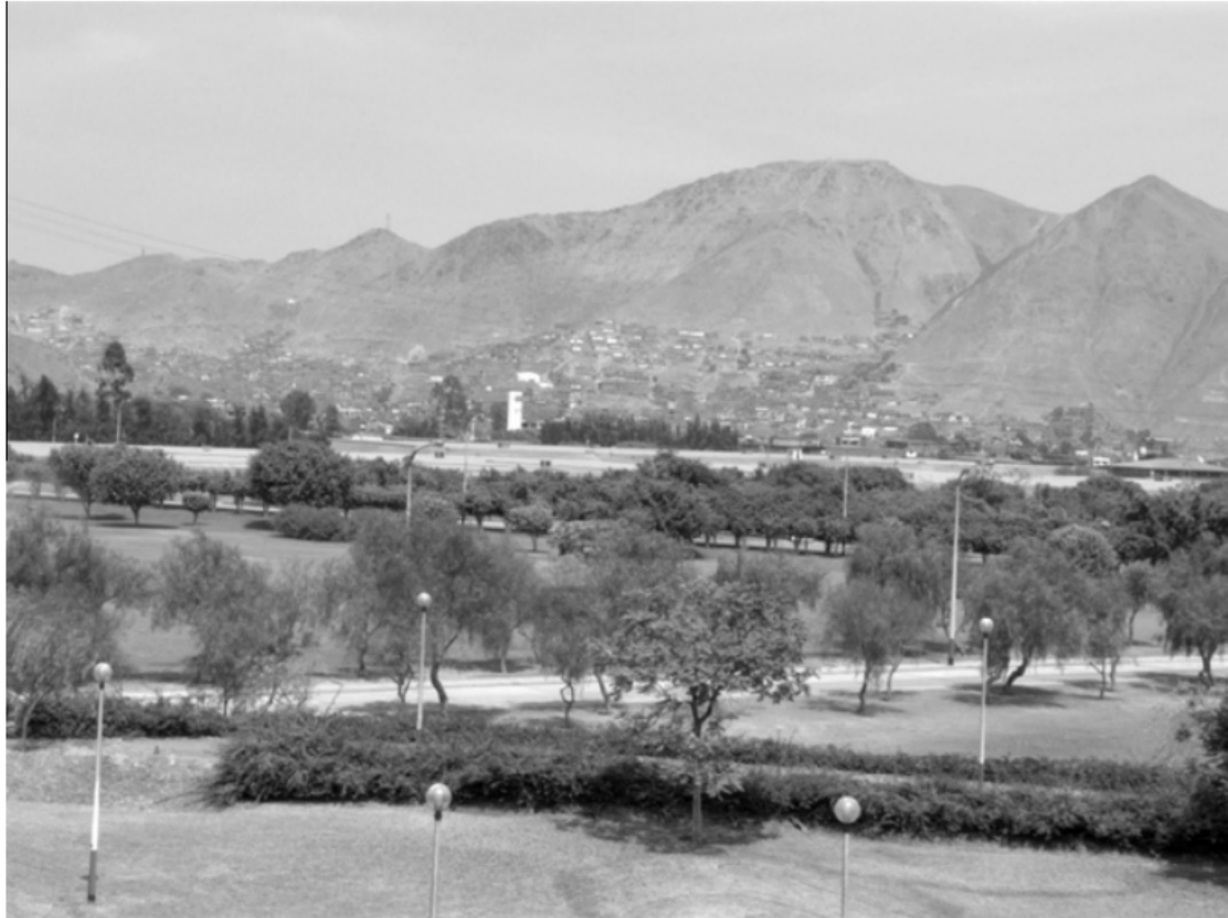
Figure 3. Contrast between the Headquarters of SEDAPAL and its Surroundings

the watercourse (not allowed during our several visits to SEDAPAL in 2009, despite the request to visit the water treatment plants and other infrastructure works). All that dramatically contrasts with the dry and dusty neighbourhood of El Agustino, the crowded corner of Lima where the utility headquarter is located (see Figure 3).