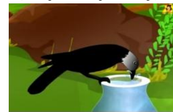
5. (Drank, relieved)