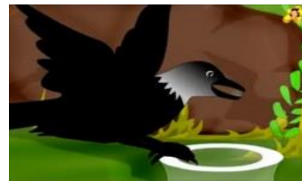
4. (The pebbles, picked up)