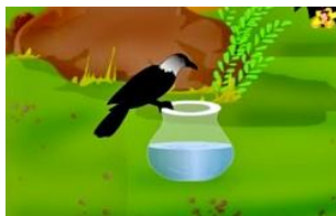
1. (A thirsty crow, a pitcher )