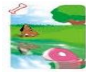
4. (drift, meat)

Orientation: One day a dog walking down by the river with happy because he had just managed to bring food. Food is a piece of meat that looks very fresh.