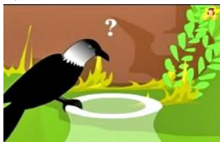
3. (Confused, to reach)