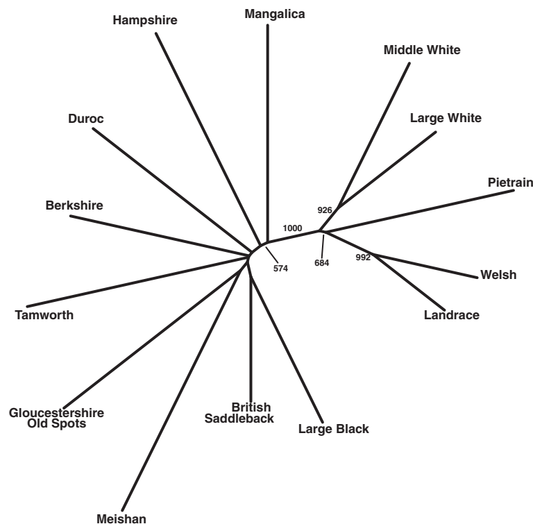
Figure 2 Phylogenetic reconstructions of the British pig breeds using Reynold's genetic distance. Bootstrap support values greater than 50% are indicated.

The results of the BAPS analysis are presented in Figure 3. Given that there are 14 pig breeds sampled in this study, if