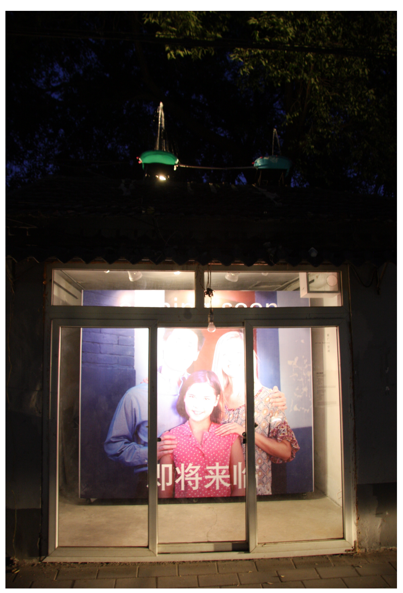
Arrow Factory, Beijing Just Around the Corner , Ken Lum 2009