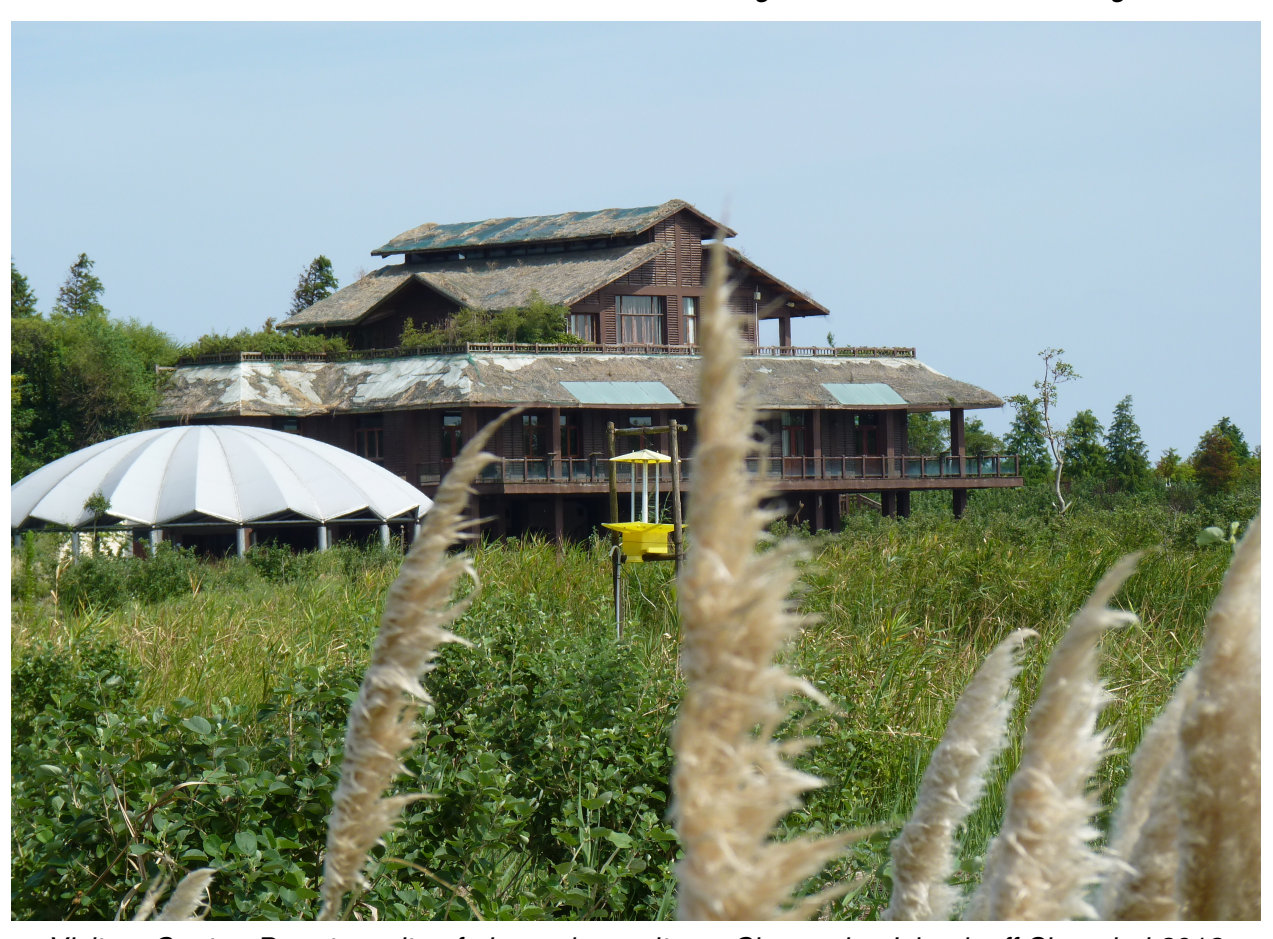
Visitors Centre, Dongtan, site of planned eco city on Chongming Island, off Shanghai 2012