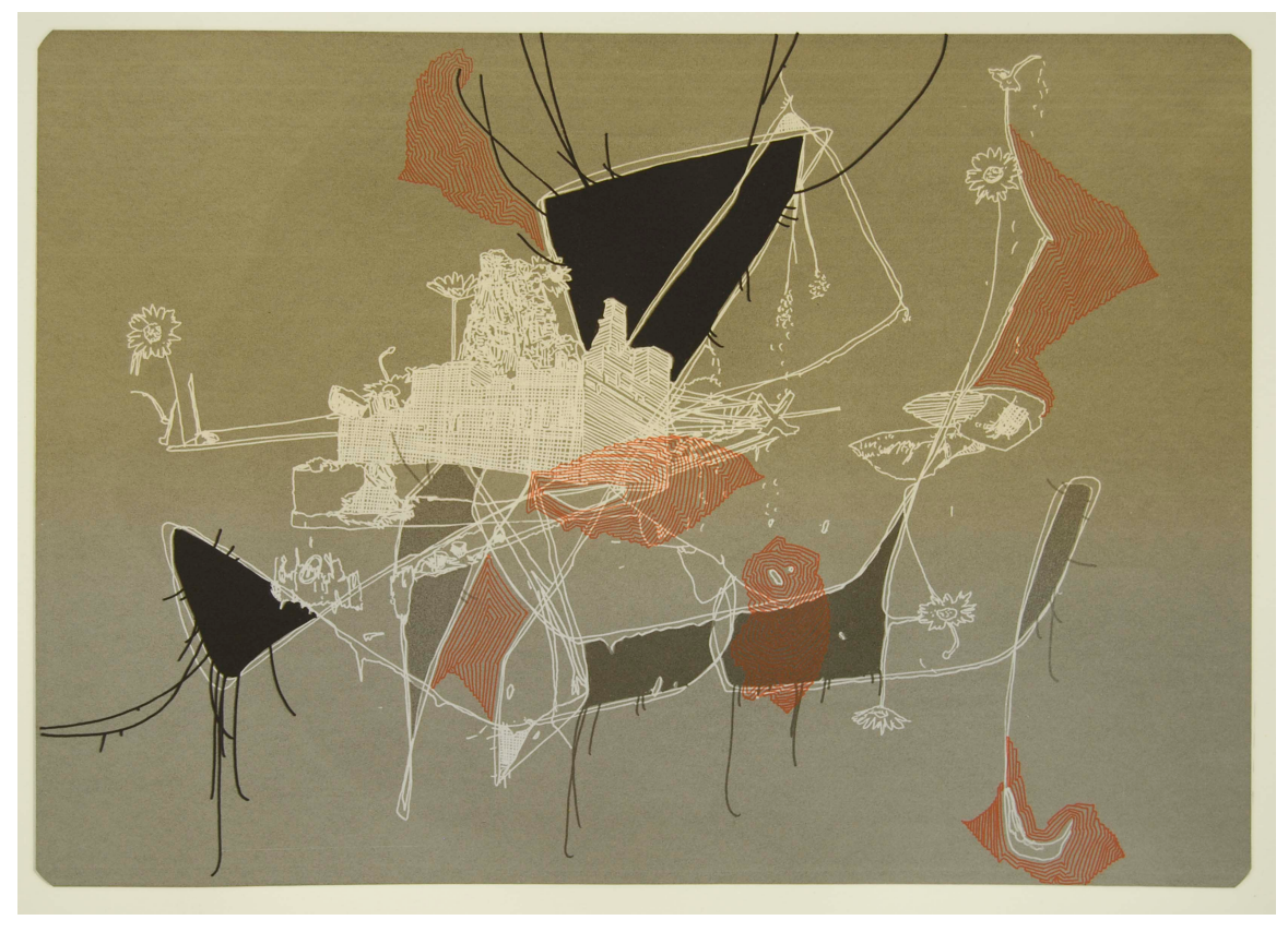
River Flowers Part of a print edition commissioned by Edinburgh Printmakers 2009

All of these shows bear indication of the development of my continuing confluence of a northern European and central Asian vision of landscape and nature, weighed against the contemporary shift towards a homogeneous global economy and these research questions have a defining influence on my academic and professional concerns.