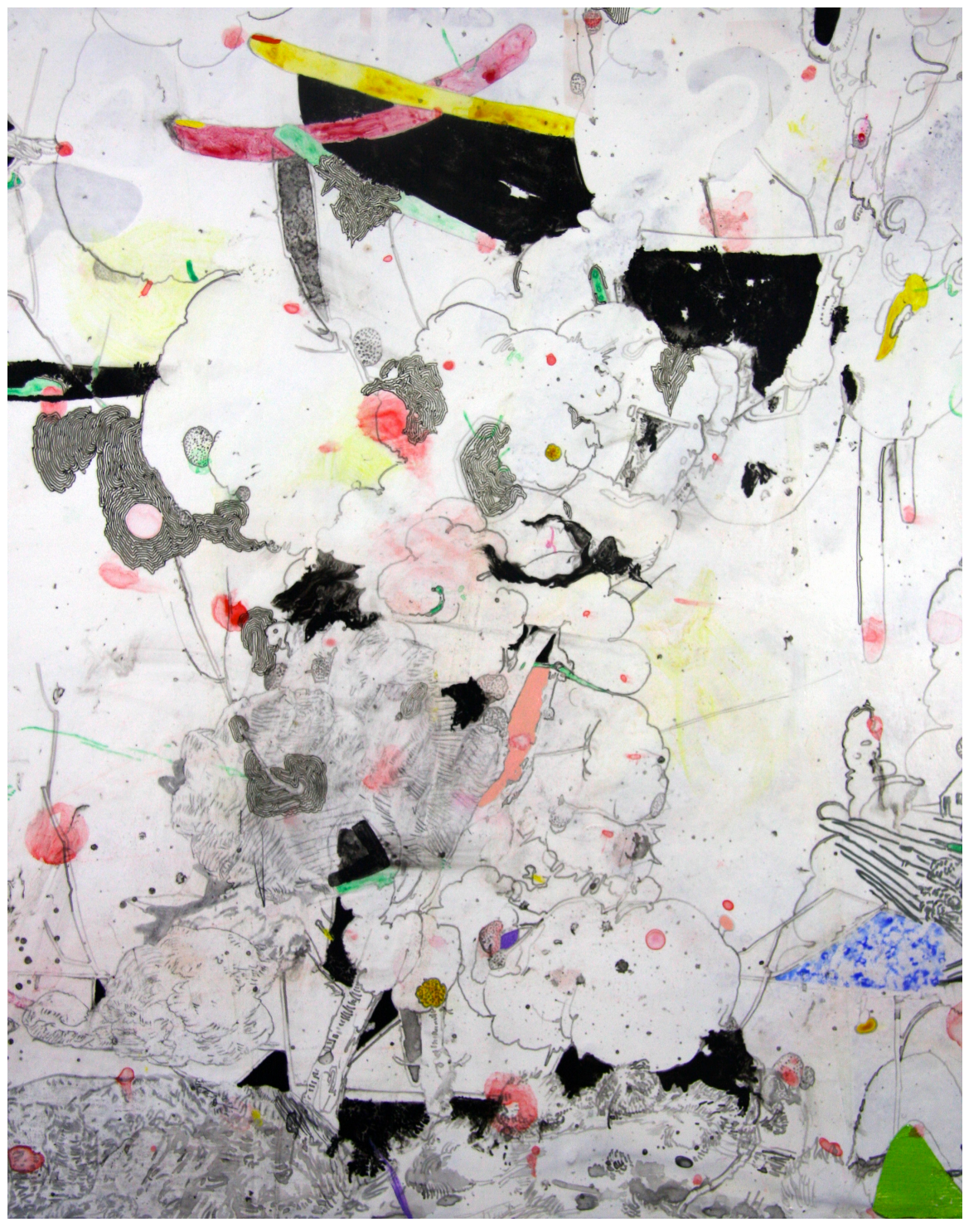
Detail: 'Magnetic Chongming' Graeme Todd 2012