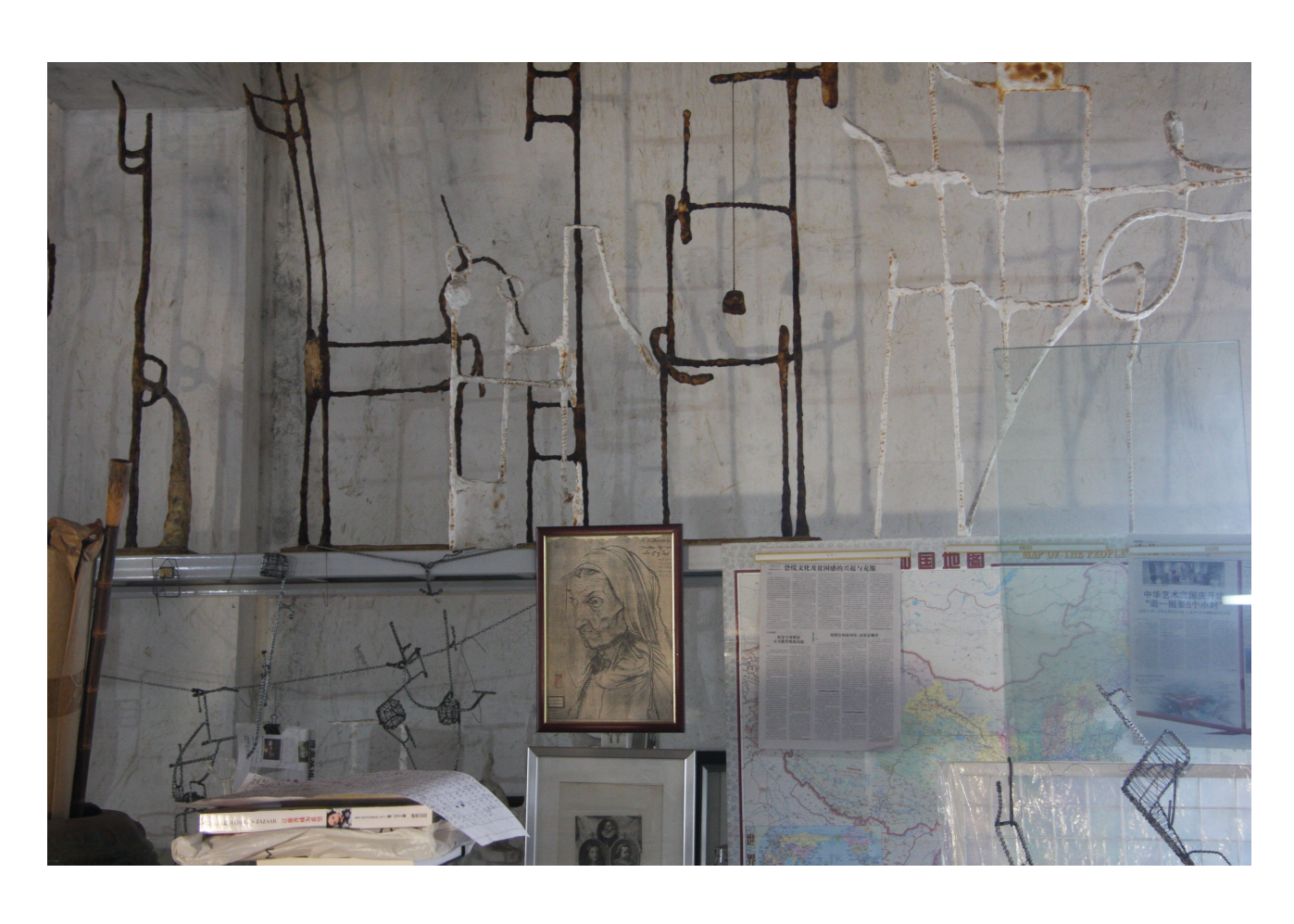
Wang Xieda's Studio near Shanghai 2012