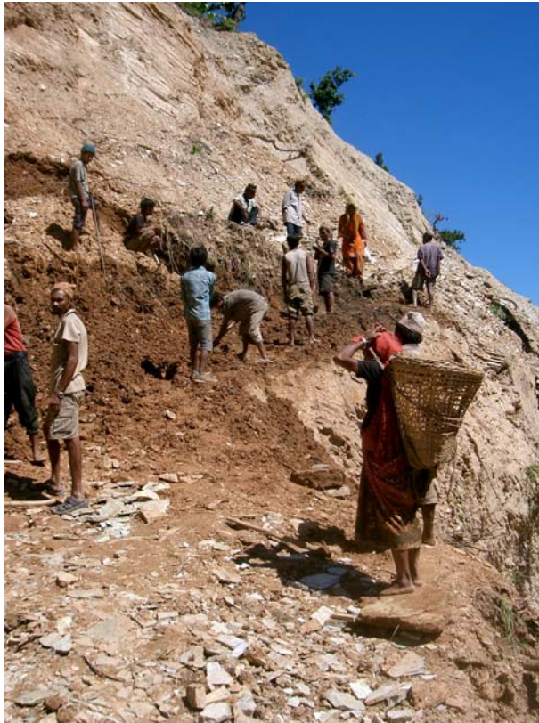
Laborers at the “green road” construction work in Rolpa district.

area. Instead, several people who took government-provided medicine suffered from side effects and complained vociferously about the program. One of the participants in an informal discussion said that “they [donors/government] have money for a disease that we don’t know of, but they don’t have money for essential drugs that we need on a regular basis.” The large number of side effects after taking the medicine spurred rumors that the government was testing the drug on the villagers.