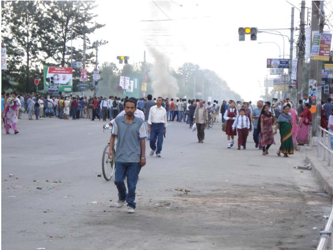
Protest in Kathmandu.

This section summarizes the voices heard during the fieldwork. We start with some general perceptions and then move to the four issues of universality , terrorism , coherence , and security .