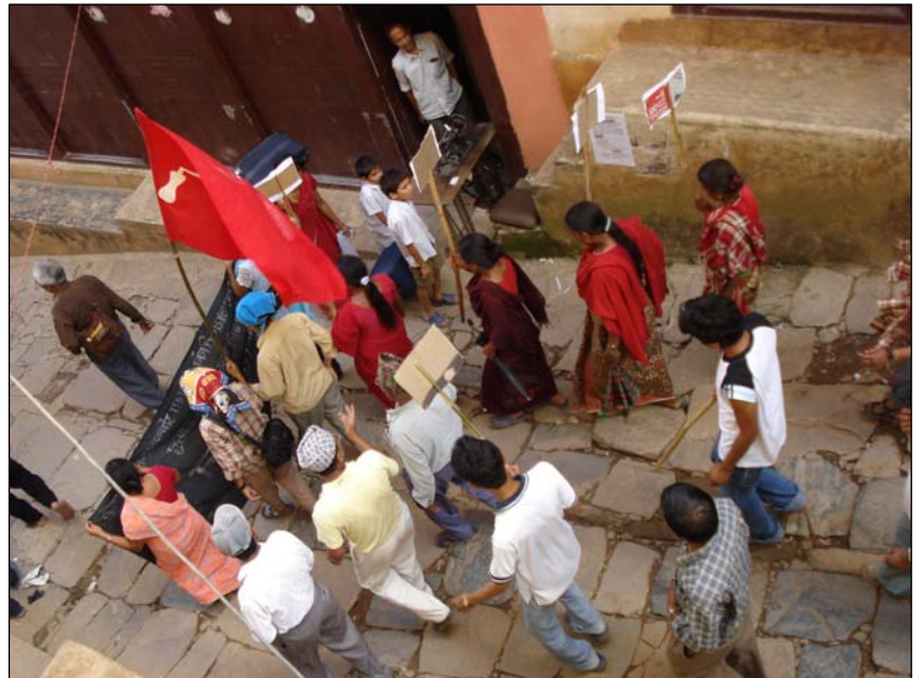
A Maoist rally in Palpa.