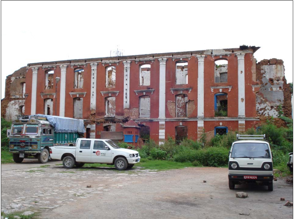
Government buildings in Tansen (Palpa district center) after Maoist attack, January 2006.