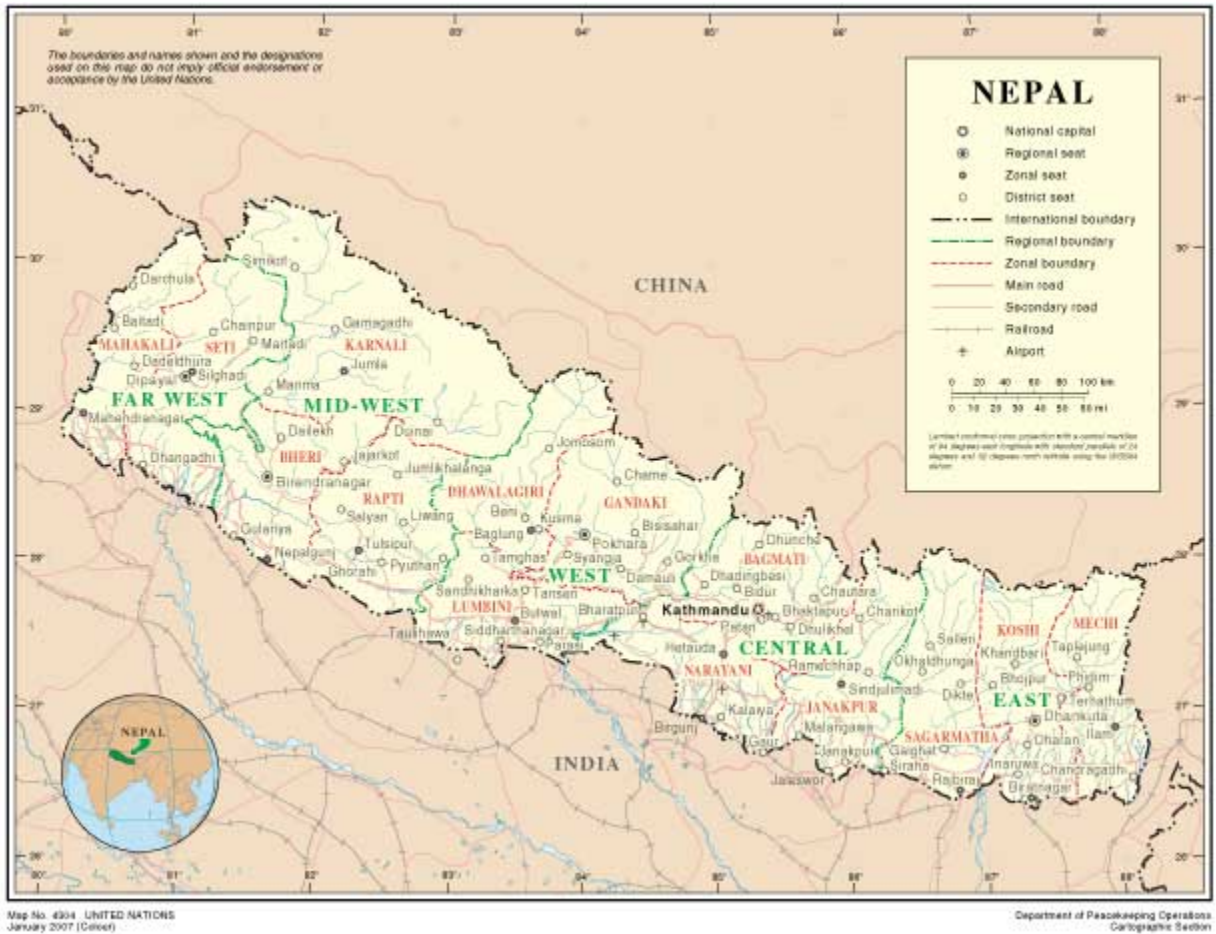
Map of Nepal

The case study ends with a number of conclusions dealing with the challenges faced by the providers of humanitarian action in an environment defined by developmental perspectives: the risks of premature withdrawal of humanitarian actors in transition situations; the distortions resulting from the (mis)use of the terrorism label; and the continuing need to nurture a more culturally-sensitive insider-outsider relationship between affected communities and the providers of assistance. Areas for further research are also identified in Annex II.