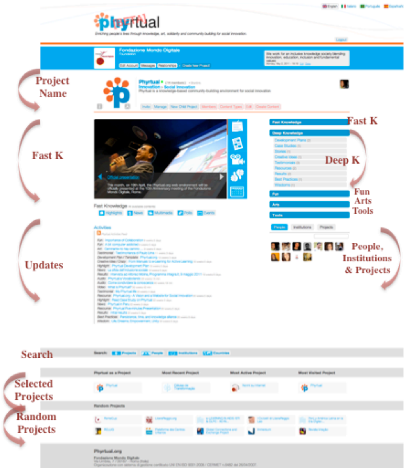
Figure 2. Phyrtual Working Area I – The Project

radical impact in the life of the project. Initially, in this field, people can propose ideas that can be voted and listed by vote ranking. This simplest of mechanisms produces a ranking of the most popular ideas inside the project.