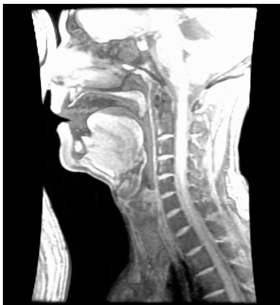
Fig. 1. Cutaway volume rendering of raw volumetric data for [a].

Figure 1 and Mm. 1 illustrate one raw volumetric scan [a], whereas Fig. 2 and Mm. 2 show a 3D vocal tract mesh extracted from that scan, along with a surface rendering of the face and head (the aliasing artifact has been removed).