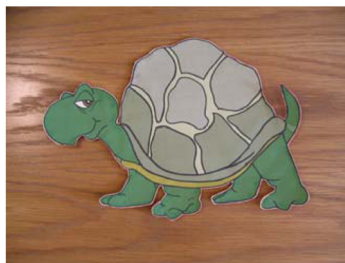
Figure 2. Stimuli used for representational tasks. 1=Representational change; 2=False-belief (puppy-lemon); 3=False-belief (hat-pen); 4=Appearance-reality; 5=Level-2 visual perspective-taking.