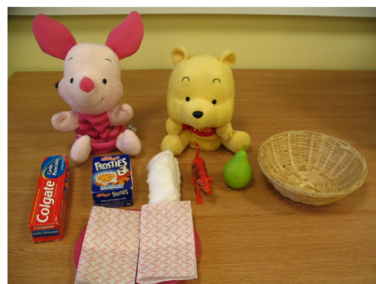
Figure 1. Stimuli used for non-representational tasks. 1=Attribution of pretend properties; 2=Object substitution; 3=Discrepant Desires; 4=Action prediction; 5=Emotion prediction; 6=Level-1 visual perspective-taking; 7=Pretend transformation and mental-reality distinction.