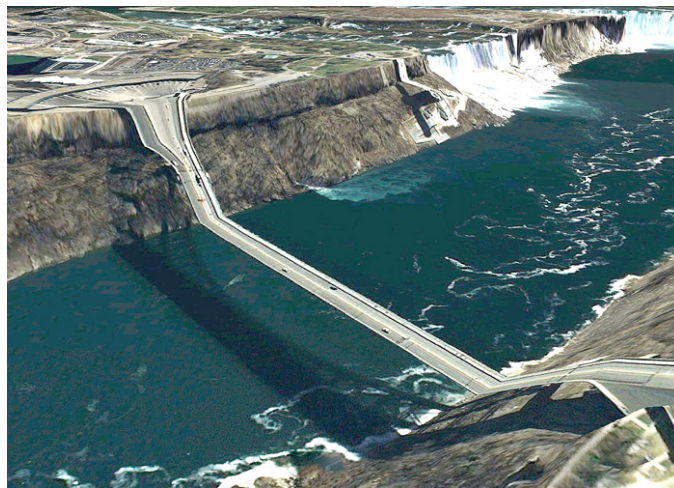
Figure 2: Postcards from Google Earth 2011. Digital image. Copyright: Clement Valla.

Glitches are a rich area of artistic enquiry, with entire publications and virtual museums devoted to artists and designers inspired by the glitch (IdN: Glitch Issue, 2011 and Mark America's project The Museum of Glitch Aesthetics , http://www.nwfor2012.com/whatson/moga ). The artist, Clement Valla, has used the glitch as source for a series of images, Postcards from Google Earth , which exploit the disruptive, imperfect, and problematic rendering of certain physical terrains by Google Earth. Valla sites his interest in glitches deriving from the fact that "Glitches generate forms that no individual has thought of or set out to create. Rather, they result from the interaction of the material processes (glitches due to hardware), the code (glitches due to software), and the user or programmer." (Valla 2011, 24)