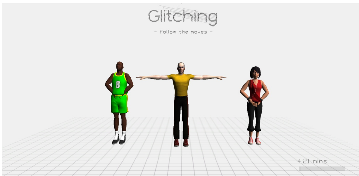
Figure 4: glitching 2012. Interactive installation interface.