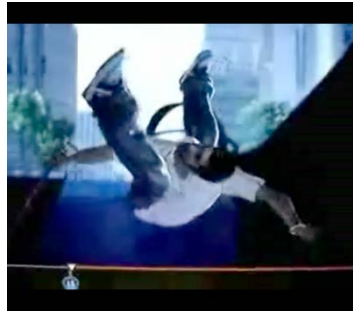
Figure 3: Skate for Xbox 360 2007.