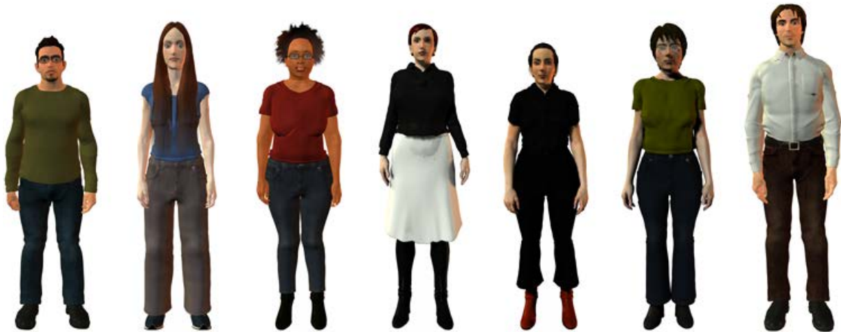
Figure 1: Doppelganger 2003-4. Digital Prints.

larger-than-life digital prints and real-time 3D, based on an international group of artists in their studios. Doppelganger is suggestive of a set of computer games characters, but one that is other than the mainstream. The characters do not exhibit fantastical, erotised proportions, but the lumps, bumps and curves of 'real' people. Ultimately this causes them to literally fray at the edges, as their normal physiques push the artificially prescribed limits of the software of their creation.