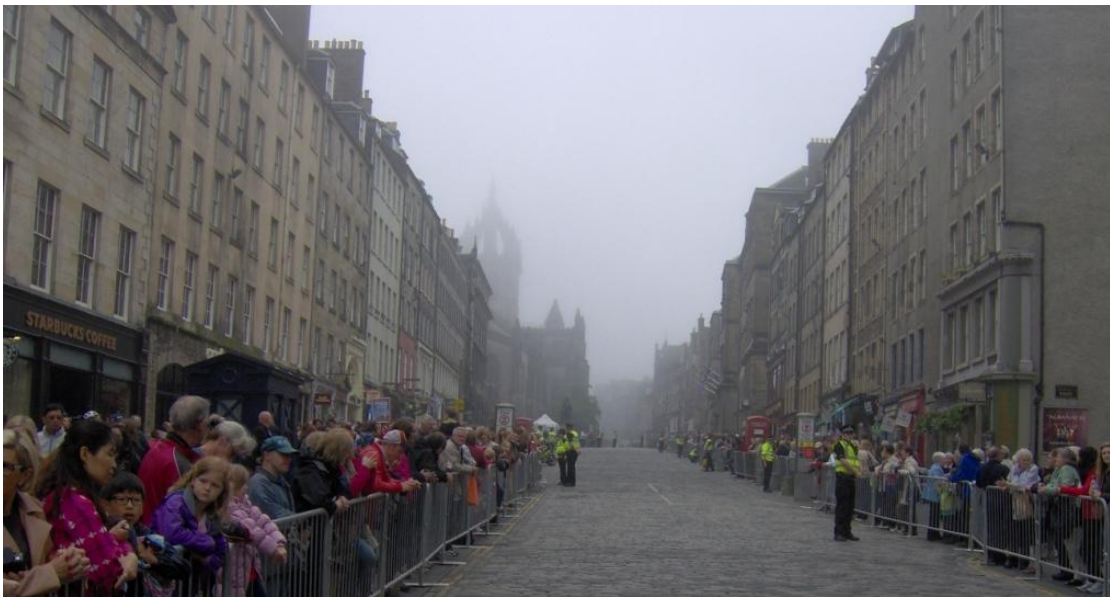
F39 (2012) A view up the High Street towards St Giles