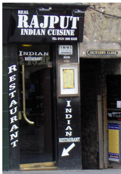
F22 (2011) F23 (2012)