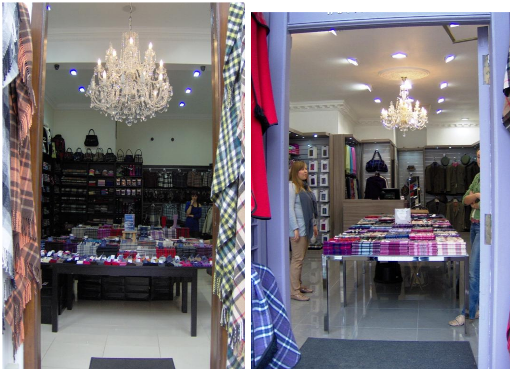
F7 (2012) F8 (2012)