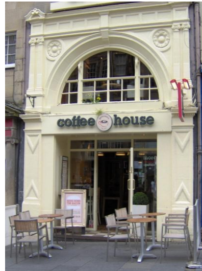
F16 (2011) F17 (2012)