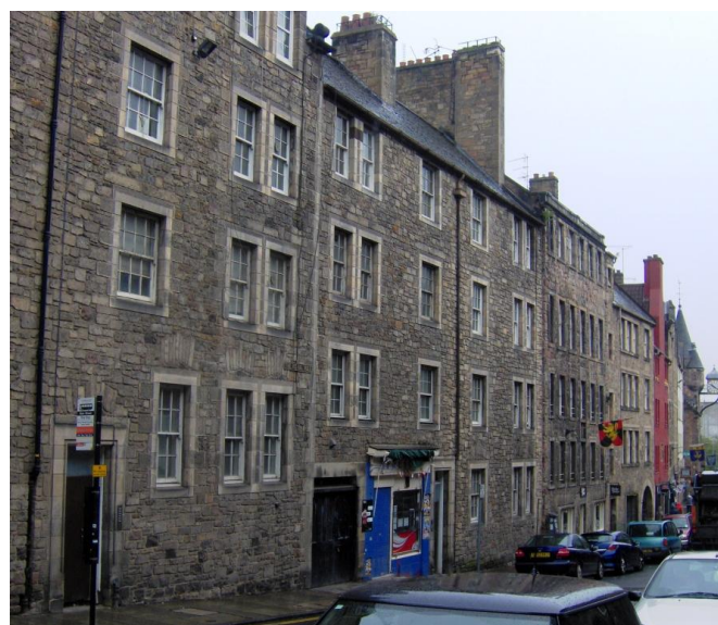
F43 (2012) A view down the north side of Canongate towards the Tolbooth in the distance