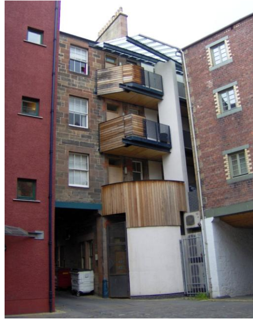
F50 Down Gullan's Close behind 250-254 Canongate