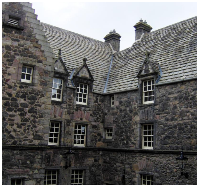
F55 The rear of the vennel entering Bakehouse Close from Canongate