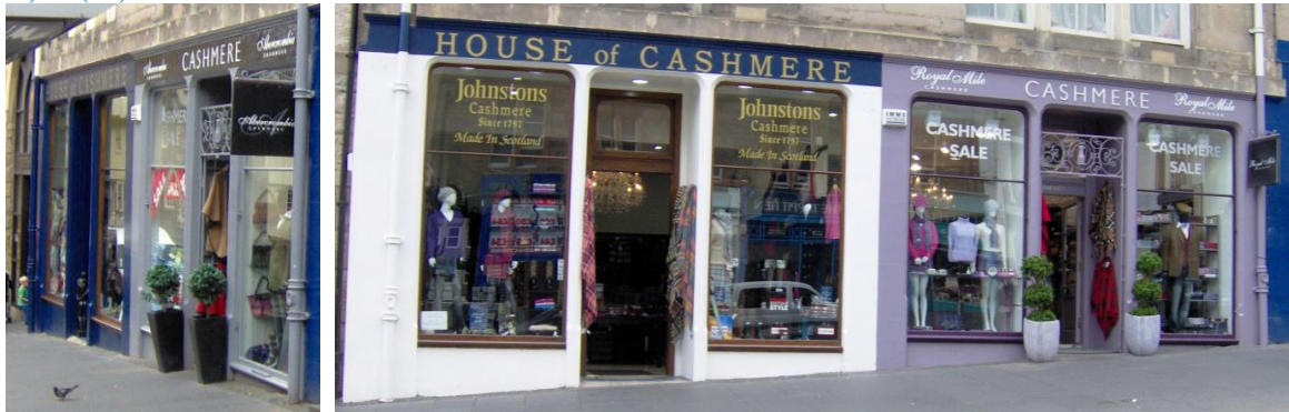
F5 (2011) F6 (2012)