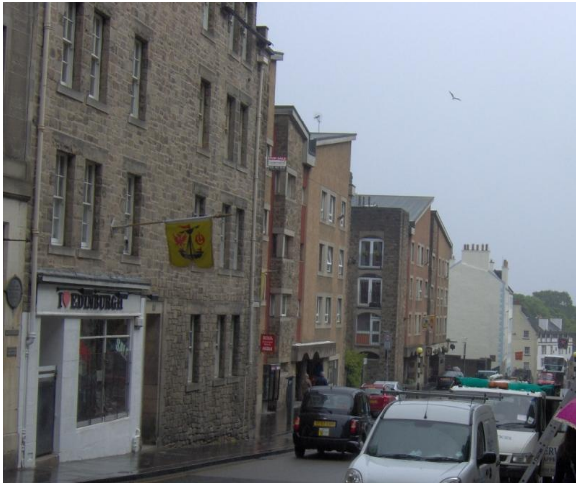
F45 (2012) A view down the north side of Canongate towards Whitefoord House in the distance