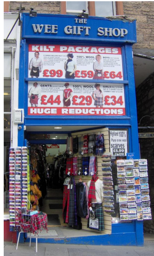
F12 (2011) F13 (2012)