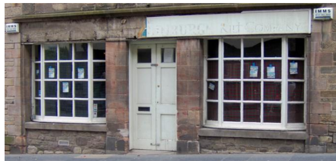
F26 (2011) F27 (2012)