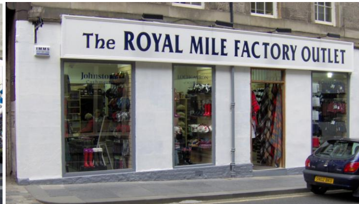
F30 (2011) F31 (2012)