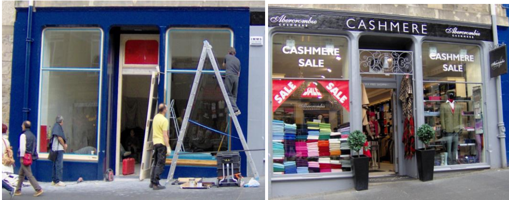
F3 (2011) F4 (2011)

[The first two photos were taken at the beginning of the audit in July, 2011. The first reveals the transformation of the former Lokaah, an outlet selling Indian handcrafts. Towards the end of that audit, the House of Cashmere (#44) was opened. A year later, the Abercrombie Cashmere (#46) had been renamed Royal Mile Cashmere and both outlets had a freshened exterior. The final two photos are taken through the front doorways of both shops drawing attention to similarities (e.g. chandeliers). These retail outlets are owned by two competing businesses.]