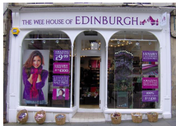
F18 (2011) F19 (2012)