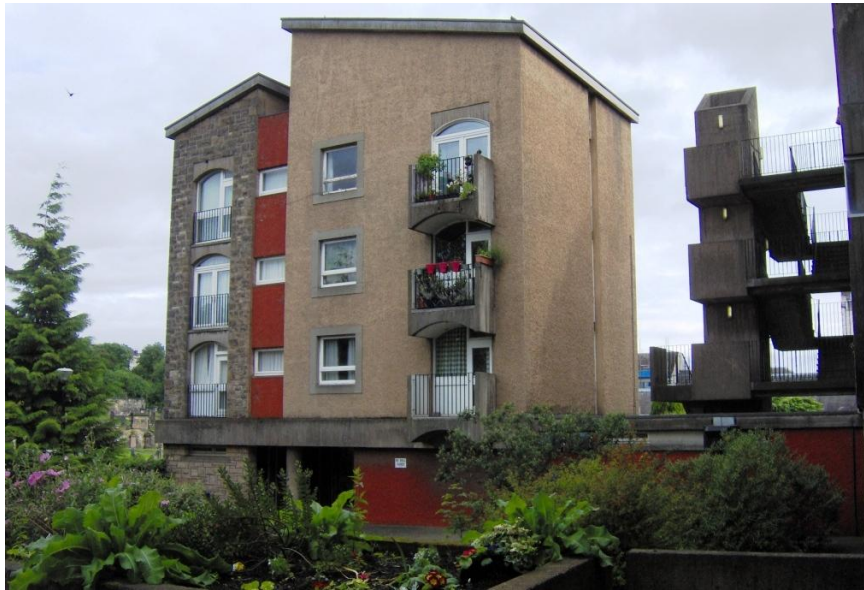
F54 Down Campbell's Close in Canongate, looking east at buildings to back of Brown's Close