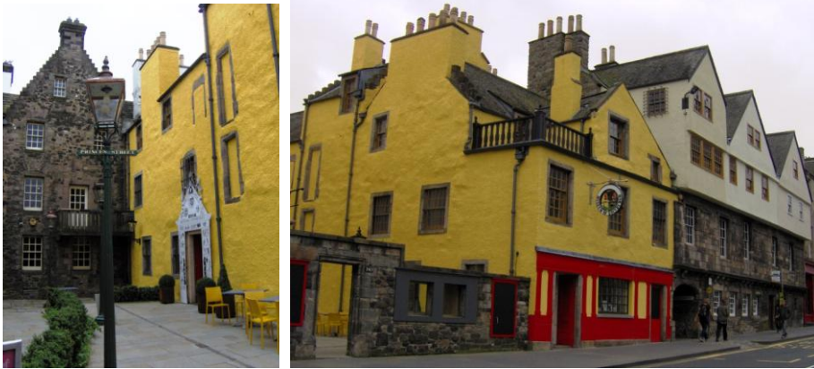
F33 (2012) F34 (2012)