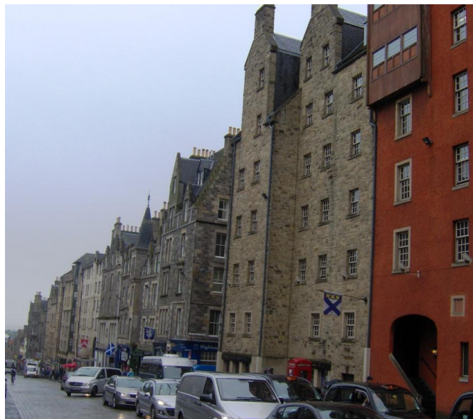
F42 (2012) A view down the south side of the High Street from North Bridge