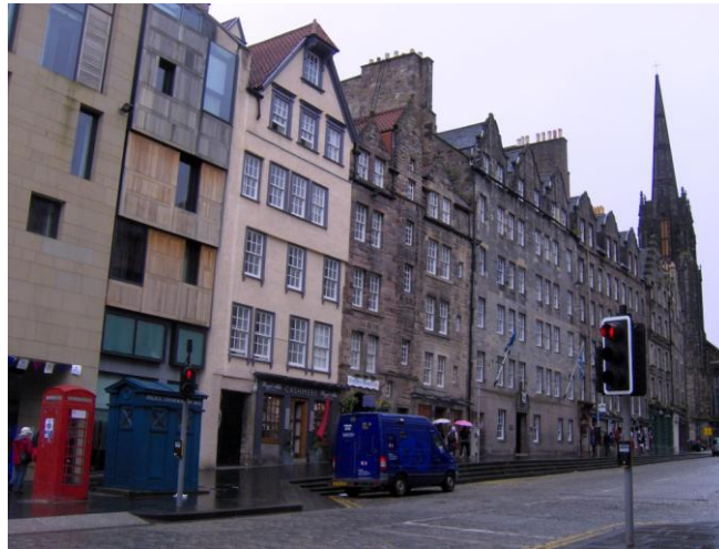
F41 (2012) A view up the south side of the Lawnmarket

Stephen A. Harwood, Dahlia El-Manstrly © 2012