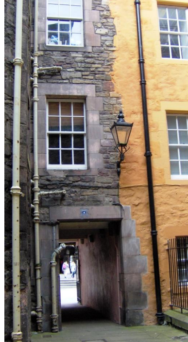
F46 The back of 324 Lawnmarket