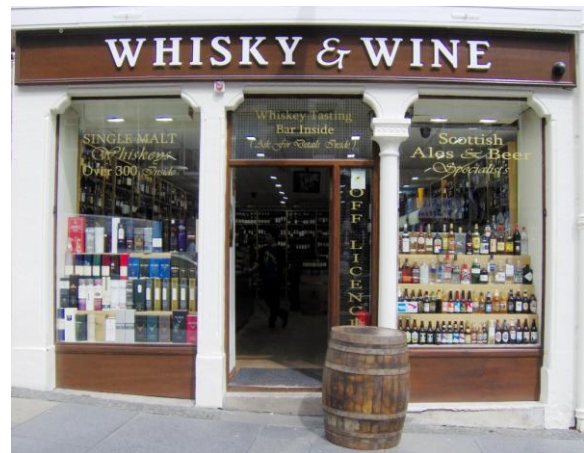
F14 (2011) F15 (2012)