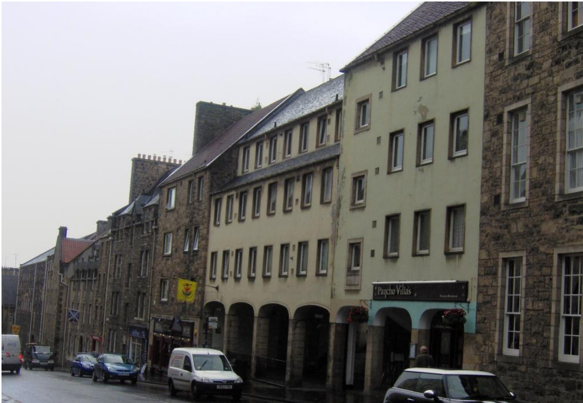
F44 (2012) A view down the south side of Canongate towards Moray House in the distance