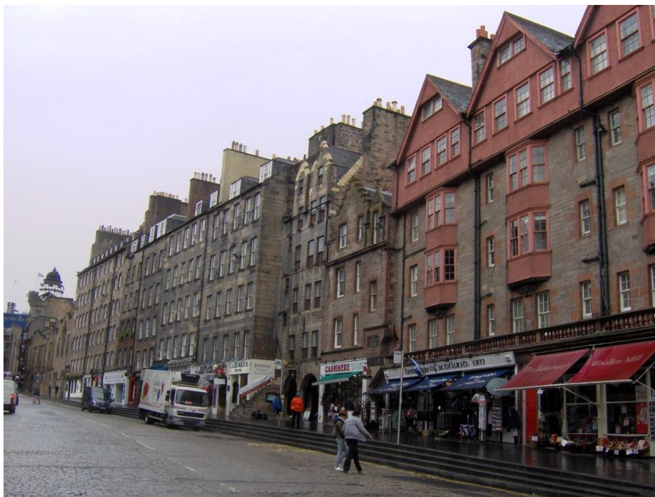
F40 (2012) A view up the north side of the Lawnmarket, with the Camera Obscura in the distance