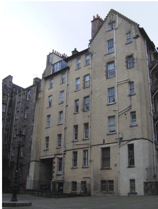
F48 View of 'Two Lady Stair Court', with balconies leading to the front doors of flats