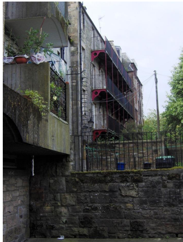
F52 Down Lochend Close in Canongate, looking east