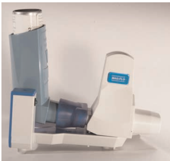
Figure 5. Mag-Flo inhaler flow indicator.

Similarly, in a group of young children apparently experienced with use of the Turbohaler device, the In-CheckDial revealed adequate PIF (>60 l/min) in only 68%. 15 In summary, the In-CheckDial is a powerful tool that can greatly aid healthcare providers when prescribing inhalers for the first time and when checking technique. It provides real-time, objective feedback to patients and may improve drug delivery and compliance. 12-15 It can be used to check PIF in patients of all ages when using DPIs, whether new to the device or not.