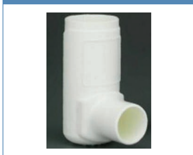
Figure 1. "2Tone" Metered-Dose Inhaler Training Device.