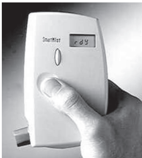
Figure 7. SmartMist.