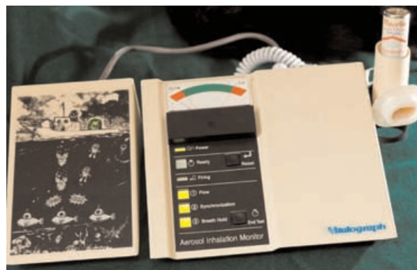
Figure 6. Aerosol Inhalation Monitor.

which indicates inspiratory flow rate, including a desired flow range. 23 During practice, the patient is asked to keep the needle gauge within the desired flow range. After completion of the full manoeuvre the device displays three coloured lights labelled "firing", "delivery" and "breath hold". A green light indicates that the patient performed the corresponding aspect of the inhalation correctly. Conversely, a red light indicates an incorrect technique. A secondary optional display provides an incentive device utilising several lights overlain with cartoon figures. 23 Thus, the Aerosol Inhalation Monitor provides health educators and patients with both a visual and a quantitative assessment of patients' inhalation technique with pMDIs. 23 Furthermore, the device has been used in patients with acute asthma to verify correct inhalation technique and as a teaching aid with variable success. 24 The Aerosol Inhalation Monitor has some disadvantages: feedback is not fully interactive and is not displayed across the entire time course of the manoeuvre, and performance parameters are not operator programmable.