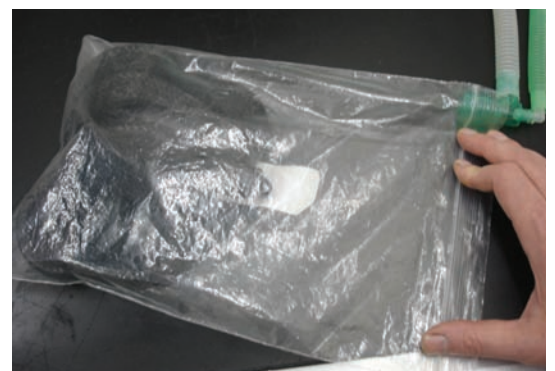
Induction of a mangrove snake using a ziplock bag filled with 5 per cent isoflurane in 100 per cent oxygen

Following induction, intubation can be performed.