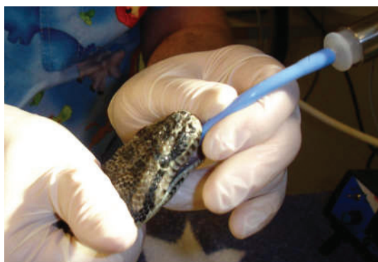
Intubation of a conscious carpet python. Ventilation is provided using a mechanical ventilator to induce anaesthesia

Reptiles must be warmed to their optimal (and thus metabolically active) temperature before anaesthesia. In addition, they should have their cloacal or oesophageal temperature monitored throughout the procedure and recovery. Measuring the temperature of animals in the vivarium can be used as a benchmark.