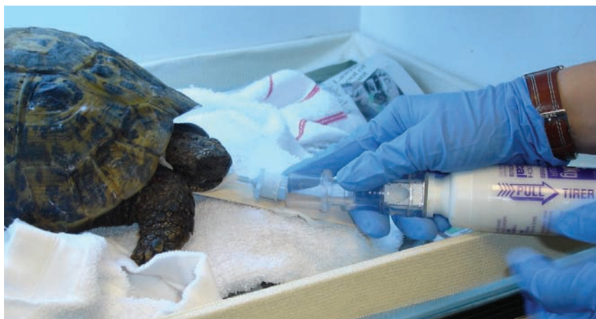
Ventilation of a spur-thighed tortoise with room air using a small animal constant volume resuscitator