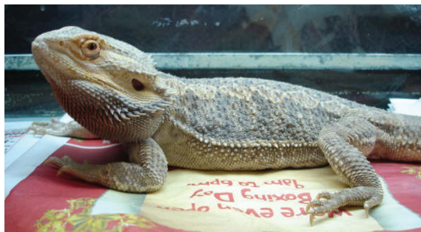
(left) Bearded dragon following ventral coeliotomy. This animal has lifted its body off the ground, which suggests it is agitated. (right) The same case after the administration of local analgesia. The dragon is lying down and is now more relaxed