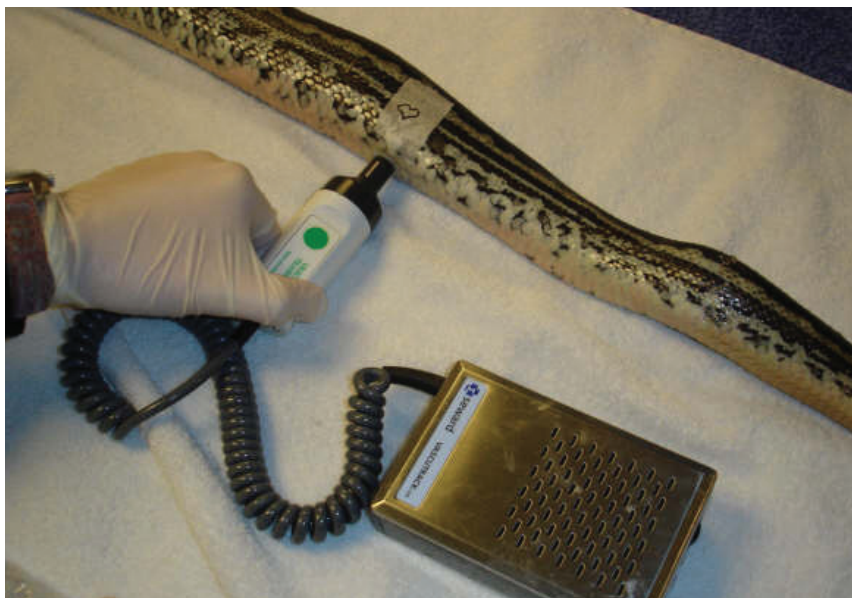
Carpet python with the location of its heart marked to facilitate repeat measurement of the heart rate using a Doppler probe

Isoflurane is routinely used by the author for maintaining anaesthesia. Studies have shown sevoflurane to have some advantages in reducing recovery times, but these reports are not consistent.