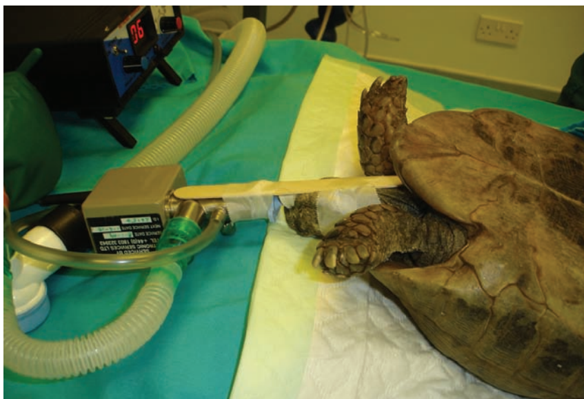
Spur-thighed tortoise intubated and attached to a mechanical ventilator. In this case, a tongue depressor is being used to keep everything in place

20 minutes of surgical time, although at low dosages, stimulation by physical manipulation can reduce their effect. Jugular veins, the subcarapacial vein and the dorsal tail vein can all be used for intravenous access. The subcarapacial vein is the easiest to access, even in very small chelonians, using a 27 gauge needle.