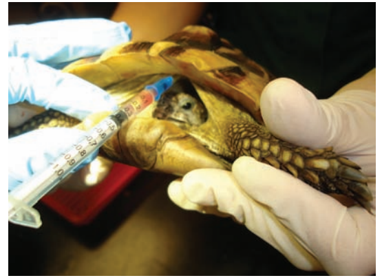
Induction of a spur-thighed tortoise using alfaxalone injected via the subcarapacial vein