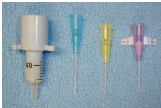
Intravenous catheters can be modified and securely attached to a cut-off 2 ml syringe and an 8 mm endotracheal tube connector

In larger squamates and chelonians, injectable anaesthetic agents are required before intubation.