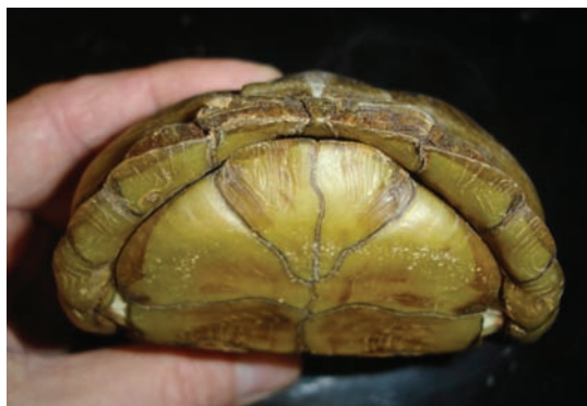
Box turtle that has retreated into its carapace. This leaves the anaesthetist no option but to consider intramuscular administration, which should be given in the pectoral musculature to one side of the hinge

Intravenous administration is possible in most chelonians. This can be carried out using propofol (10 mg/kg), alfaxalone (5 to 10 mg/kg), medetomidine (0.15 mg/kg) or ketamine (5 to 15 mg/kg). Medetomidine and ketamine have also been used in combination. The author's agent of choice is alfaxalone. Many of these products can be given to effect; lower doses can be administered to patients that require heavy sedation for radiography, ocular examination or oesophagostomy tube placement without having to resort to intubation and prolonged anaesthesia. Propofol and alfaxalone provide