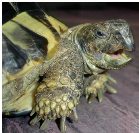
Spur-thighed tortoise showing an acute pain response to ketamine inadvertently injected subcutaneously