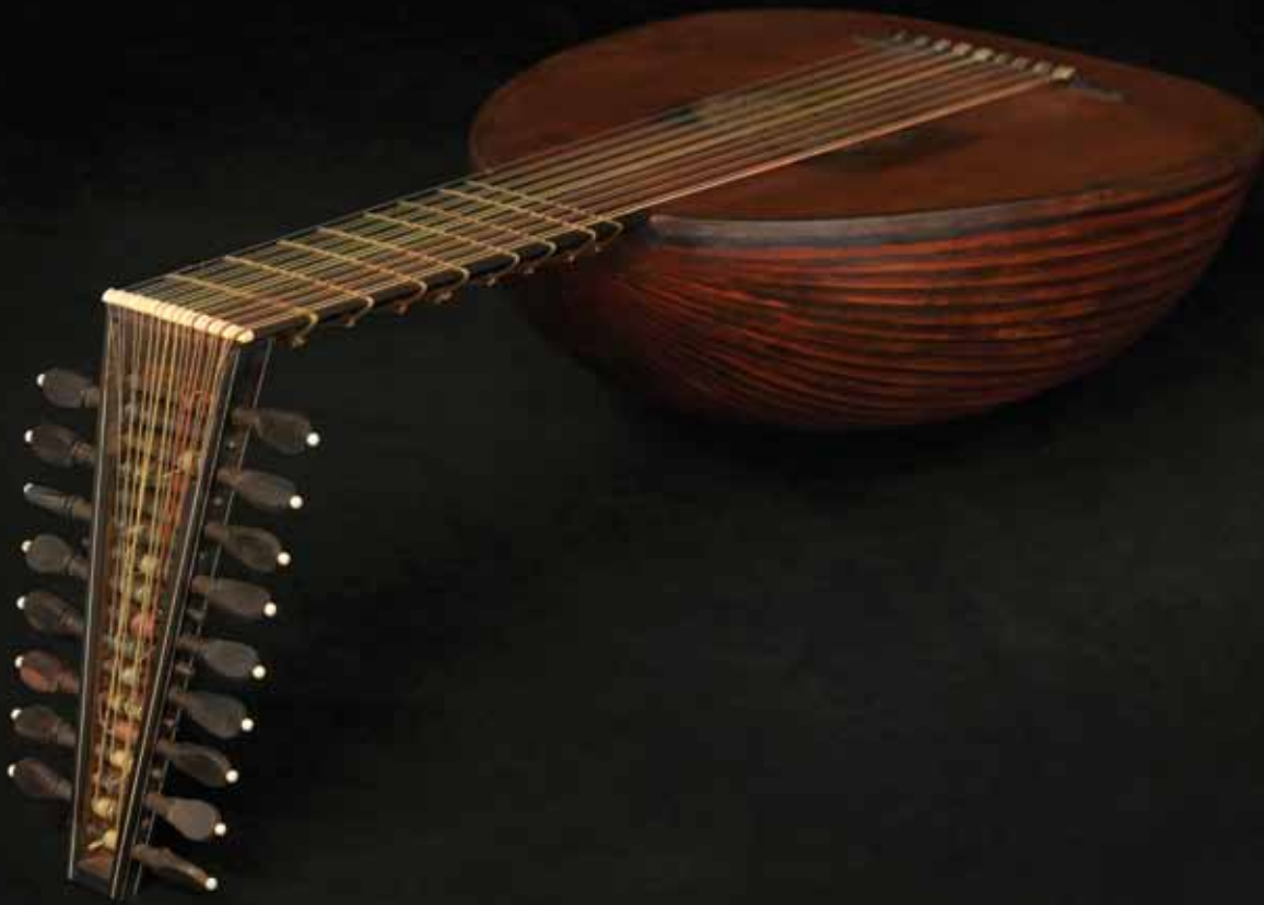
Lute from the time of Wode (Exhibit 14)

With some variations, metrical psalms were sung in the Protestant churches of early modern Britain and Ireland and they crossed the Atlantic with the Pilgrim Fathers and settled in America. British sailors, soldiers and settlers sang them across the globe on sea and land, helping establish the metrical psalms within the heritage of the English-speaking world. Vernacular metrical psalms were also sung throughout Protestant Europe, especially by churches in the Reformed tradition, and helped turn Protestantism into a mass movement during the sixteenth and seventeenth centuries.