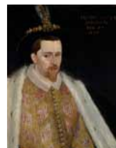
King James VI, Scottish National Portrait Gallery