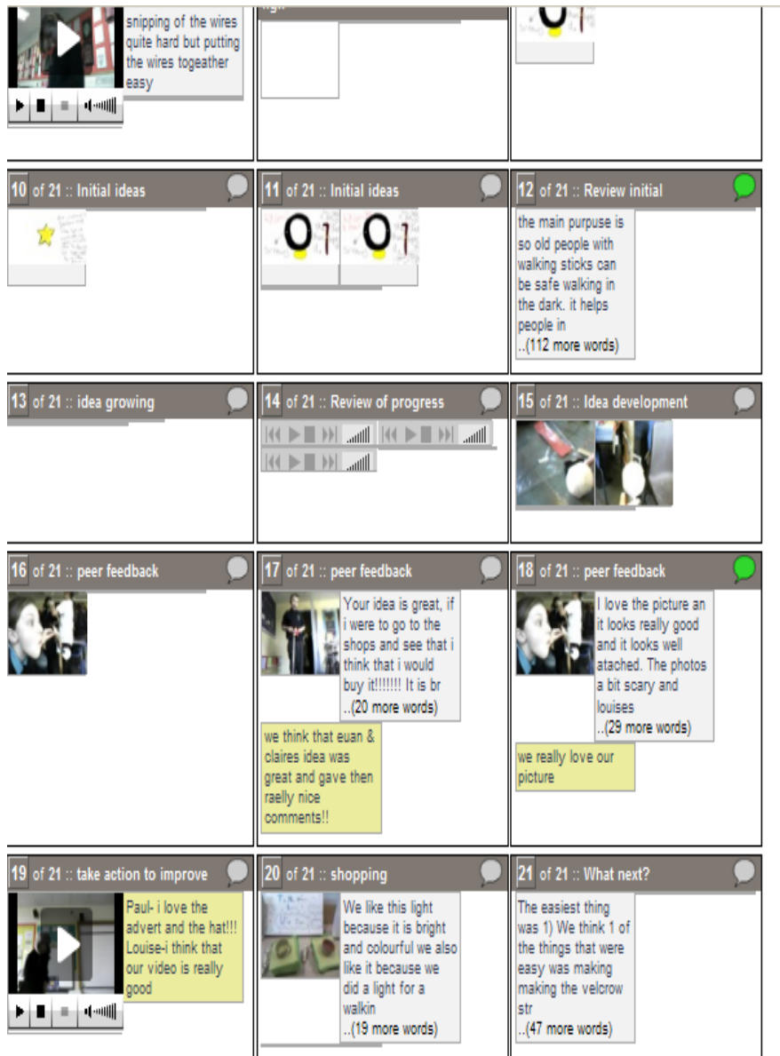
Figure 4. Overview of e-portfolio with comment to be read from teacher indicated by a green flag.

Teachers can provide feedback, prompts, encourage reflection and set targets for the learner in text or audio format (Figure 4). The learner can access the feedback from the e-portfolio on the device at any time.