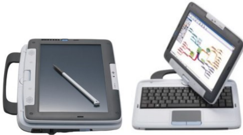
Figure 1. The portable devices used to capture thinking in real time through e-scape system

To create the interactive e-scape system in a classroom / workshop a number of steps were necessary.