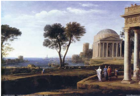
Fig. 1: Landscape painting by Claude Lorrain

Scottish examples of where the approach was adopted were presented through a comparison of photographs and drawings of projects from the period with the picturesque landscape paintings of Claude Lorrain (Figure 1). The comparison illustrated the similarities between the picturesque 17thC view of the relationship of landscape and architecture with contemporary representation of modernist buildings in mature landscapes which, if designed at all, dated from a much earlier period. Thus 'Landscape with Aeneas at Delos', 1672 was juxtaposed with a photograph of Gillespie Kidd & Coia's CIA's St Brides Church, East Kilbride (Figure 2); Landscape with Apollo and the Muses, 1652 was compared to James Stirling's St Andrews University student residences and Landscape with Shepherd (Pastorale) was presented beside Robert Matthew's Stirling University campus.