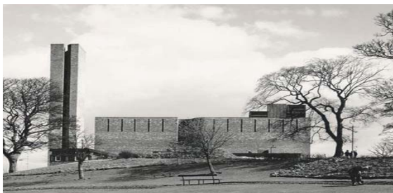
Fig. 2: Gillespie Kidd & Coia's CIA's St Brides Church, East Kilbride

Furthermore the drawings of Basil Spence's Mortonhall Crematorium and Newton Aycliffe housing and William Whitfield's Glasgow University (Figure 3) were analysed for their representation of landscape as decorative (picturesque) components of the view.