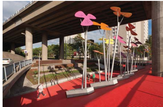
Fig. 4: Garscube Landscape Link

whilst seeking to balance the introduction of consciously new elements within a reconfiguration of the existing spatial qualities.