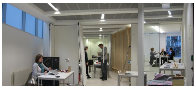
Fig. 4. The Art, Space & Nature studio.

For effective reflection in action Schön argues that the micro-culture, or specific design venue is important to provide a setting to understand a problem better (Schön 1983: 69). For the often dispersed activity of ASN we greatly value the presence of our studio base as the specific venue for our activity. While the programmes vitality stems from a complexity of contexts and projects, this is counterbalanced through the consistency of a stable working space and regular meeting point for students, providing a continuity of structure where all students can meet and discuss ideas. The studio has become the hub for activity, with meetings, lectures, seminars, exhibitions and events contributing to a sense of a space that is collectively owned and controlled by the students, but structured to engage varying public activities. A great asset for the programme is that the studio has a gallery with public street interface, offering students an immediate context to test ideas, while promoting the public engagement of work even within the studio.