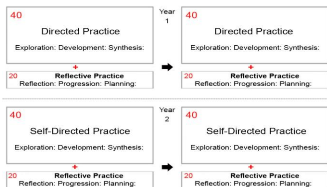
Fig. 5. Diagram of the 2 year MFA programme.

What we have learnt is that multidisciplinary education is of great value and range, but its basis must stem from identifying with the individual student, who participates and contributes meaningfully, while benefiting through specified developmental attributes. Certain tensions may be attributed to the ambitions of any innovative programme, such as; the intensive nature of organization, the ability and maturity of students to negotiate a self directed programme, the resources required to facilitate an international dimension, and the internal politics and personalities of strong individuals involved. In a sense these are all aspects that make up the vitality of a multidisciplinary field, where ASN's particular success relates to an emphasis of balance, where the multiple is cultivated with regard to the position of the individual and their development through a dynamic educational structure. The conclusion of this paper will set out how we achieve this aspect, with particular regard to learning through action, reflection, and planning.