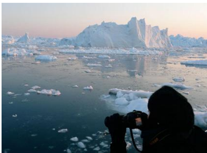
Fig. 3. A research led field project in Greenland.

This provides a professional context for students to learn from, often involving aspects of project delivery, such as grant applications, client consultation, public engagement and media dissemination, which are less common to conventional taught courses. Professional input supports a broad range of approaches to digital media, structural expression, practice documentation and publication, field and visual theory, offering students a balance between practical skills, interrelated with theoretical reflection. In effect ASN offers a connective structure of individuals, projects and networks that reflect the realities of professional practice, while providing a focus of interrelated action for a number of research centers' within the institution.