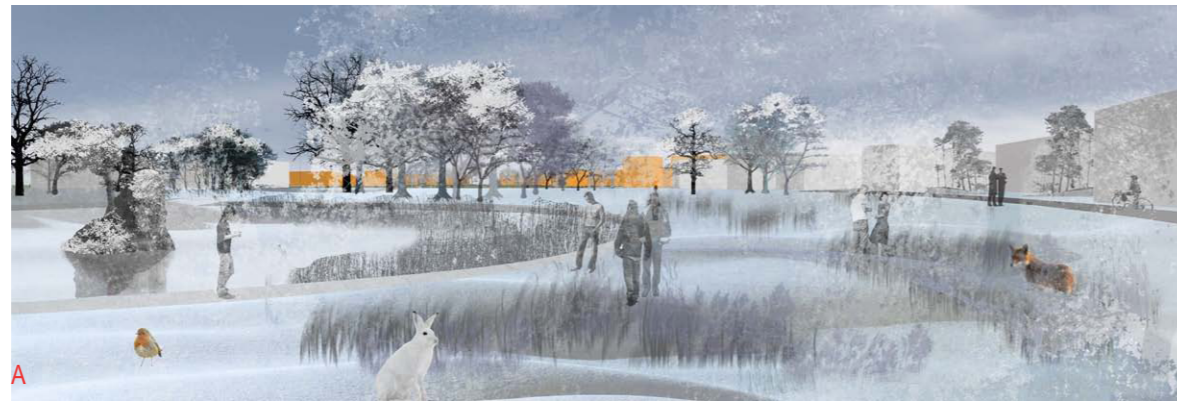
image C The Public Realm Public Art Strategy