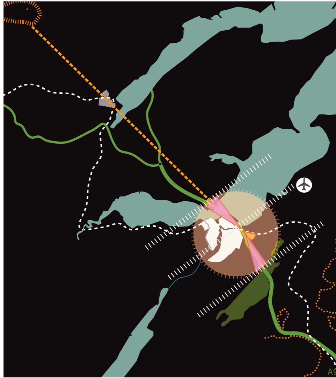
Diagram: Understanding Regional Landscape Thresholds as a means of structuring the Inverness Campus Masterplan.