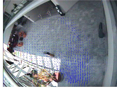
Figure 1. Eigenflows for the normal training set (first eigenvector).

emergency event are shown in Fig.3.(b). There is a clear and quick drop in the likelihood function less than 100 frames (4 seconds) after the exit blocking. The size of the observation window used to compute the likelihood in Fig.3 is 50 frames. Larger window sizes tend to smooth the likelihood function reducing the sensitivity of the detector. The detection threshold Th_{Ab} is defined as a value smaller than the minimum likelihood value present in the normal training set. In order to evaluate the influence of the number of eigenvectors J in producing a likelihood drop to be detected using Th_{Ab} another experiment using 5 independent simulation runs for the blocked exit event are produced, with 3000 frames per sequence and the blocking occurring at frame 2000. The comparison is based on the average likelihood for each sequence before and after the event and is summarised in Table 1. The trend shows that the best detection performance is achieved with J = 10 . However, it is necessary to correctly select the appropriate number of eigenvectors carefully.