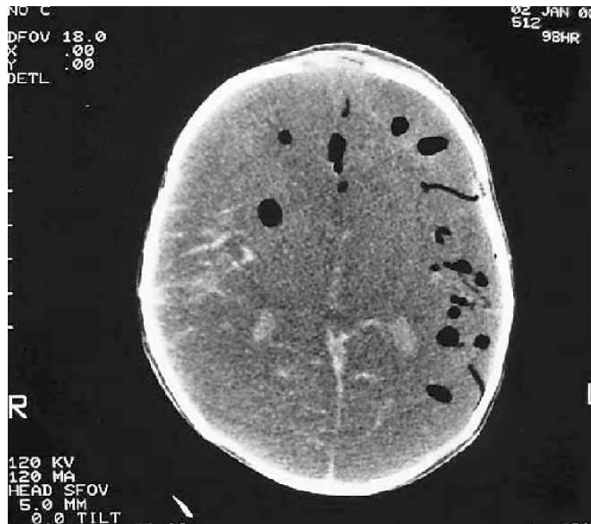
Figure 1 Computed tomography scan of the brain of a 10 day old male infant showing diffuse pneumocephalus.

Mafraq Hospital, PB 2951, Abu Dhabi, United Arab Emirates; sreza@emirates.net.ae