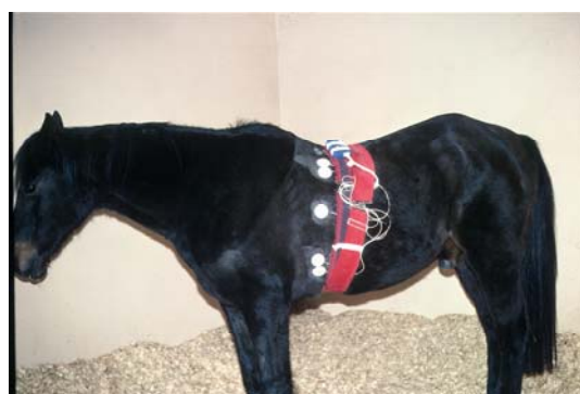
Fig. 1: Position of electrodes for recording ECG by Holter monitoring

Ponies were acclimatized to the recording location (5 m × 4 m loose box) for a minimum of 5 h before the start of recording. During the acclimatization period, hair was clipped from the 5 anatomical sites used for electrode placement; these included 2 areas on the left side of the withers (for positive electrode placement), 2 areas on the left hemithorax level with the elbow at the fifth or sixth intercostal space (for negative electrode placement; Fig. 1) and one location for the earth electrode. Following cleansing of the above 5 areas with alcohol, soft adhesive electrodes were applied (Cardiacare Ltd, Romford, Essex, UK) and connected to the respective leads from the Holter monitor receiver (Unolter, Novacor S.A., 4 Passage Saint-Antoine, 92508 Rueil-Malmaison, Cedex, France), which was placed within a pocket on a curcingle fixed around the girth area. A rug was placed over the equipment and secured with an anti-cast roller. The Holter monitor had two bipolar lead systems.