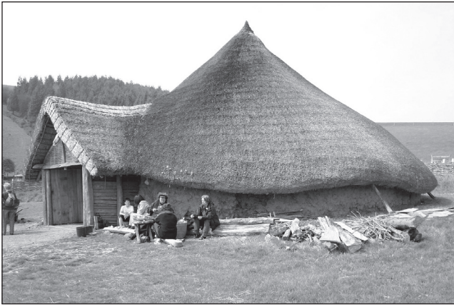
■ Fig. 3 The great Roundhouse at The Butser Experimental Farm, Hampshire, England.