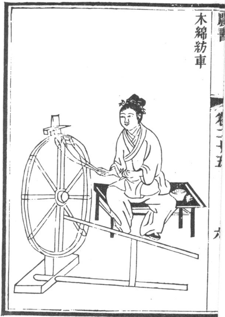
Figure 3. Spinning wheel for cotton. Wang Zhen's Nongshu (Agricultural Treatise), 1783 Palace edition, Chapter 25, 6a.

In the case of the cotton-processing implements, the gin, bow, spinning wheel and multi-bobbin reels which Wang Zhen describes for the first time in his 'Illustrated register' (Figure 3), his accounts seem to have passed muster even with the exigent Xu, who adds only a few notes explaining minor changes in structure or operation. 63 Here Wang's hope for diffusion was realized: these implements were gradually adopted