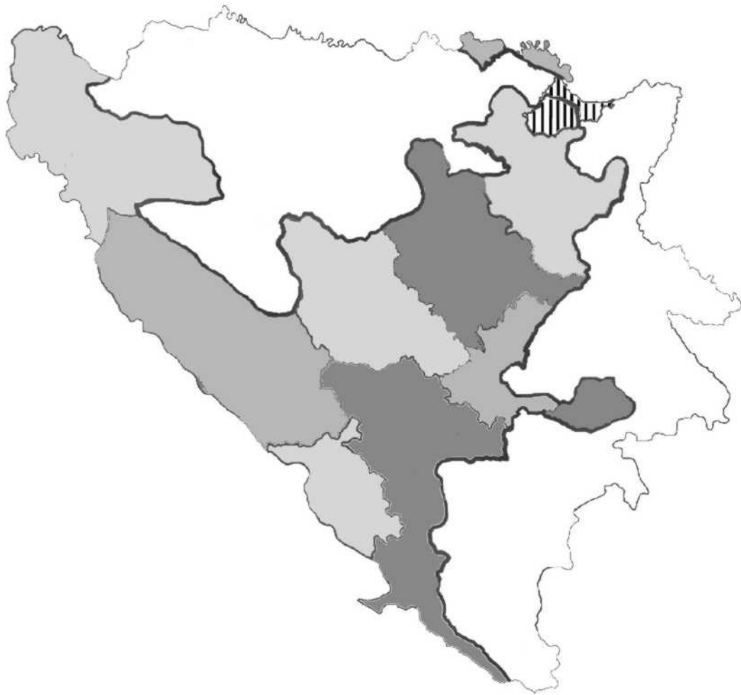
Insert (Map 1)