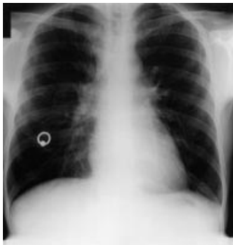
Figure 1 Chest radiograph on admission showing bilateral hilar and right paratracheal lymphadenopathy with diffuse reticular infiltrates and mild focal infiltrates at the left costophrenic angle and within the right mid-zone

samples were negative for bacterial pathogens, including Clostridium difficile , Salmonella spp, Shigella spp, Campylobacter spp and Escherichia coli . Three "hot" stools for ova, cysts, and parasites revealed no cryptosporidia or microsporidia. Three stool samples for faecal occult bloods were negative. A chest radiograph was abnormal (fig 1) showing bilateral hilar and right paratracheal lymphadenopathy with diffuse reticular infiltrates and mild focal infiltrates at the left costophrenic angle and within the right mid-zone. A sputum sample was negative on Gram and auramine staining and was sent for culture for bacteria, mycobacteria, and fungi. An ultrasound scan of the abdomen confirmed hepatosplenomegaly but showed no ascites or intra-abdominal lymphadenopathy. Admission blood cultures were reported as negative. Blood serology, including toxoplasma latex and syphilis TPHA and RPR were negative. Hepatitis A IgG was positive, IgM was negative; hepatitis B serology showed anti-HB core positivity, HBs Ag negative and anti-HB surface positive. Hepatitis C antibody was negative as was hepatitis C RNA. An investigation was performed which was diagnostic.