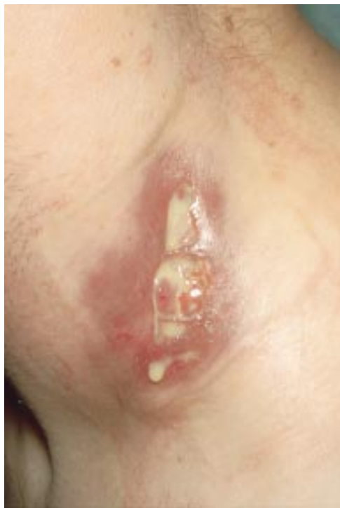
Figure 5 Discharging cervical lymph nodes.

Culture of aspirate from the lymph nodes showed that the mycobacteria were M avium complex. This organism was also cultured from stool and sputum samples which had been collected from the patient on admission to hospital. The isoniazid was discontinued and a course of oral prednisolone was given. This and subsequent non-steroidal anti-inflammatory therapy has had little impact on the size of the lymph nodes, which continue to discharge, 4 months later.