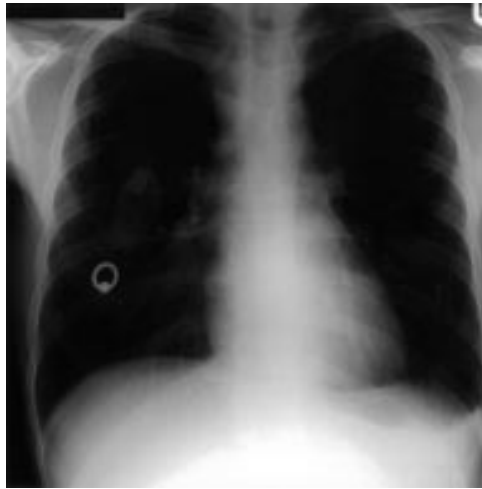
Figure 3 Chest radiograph on day 19 of admission. The lung fields have cleared but there is persistent lymphadenopathy.

nied by a recrudescence in fever. Repeat cultures of urine, stool, and blood were negative. An ultrasound of the neck revealed multiple homogeneous lymph nodes. A CT scan of the neck revealed multiple highly vascular lymph nodes (fig 2) and a repeat chest radiograph showed normal lung fields but persistent lymphadenopathy (fig 3). Four days after the onset of increasing cervical lymphadenopathy a fine needle aspirate (FNA) was performed. This was initially reported as showing only red blood cells, polymorphs, neutrophils, and necrotic debris.