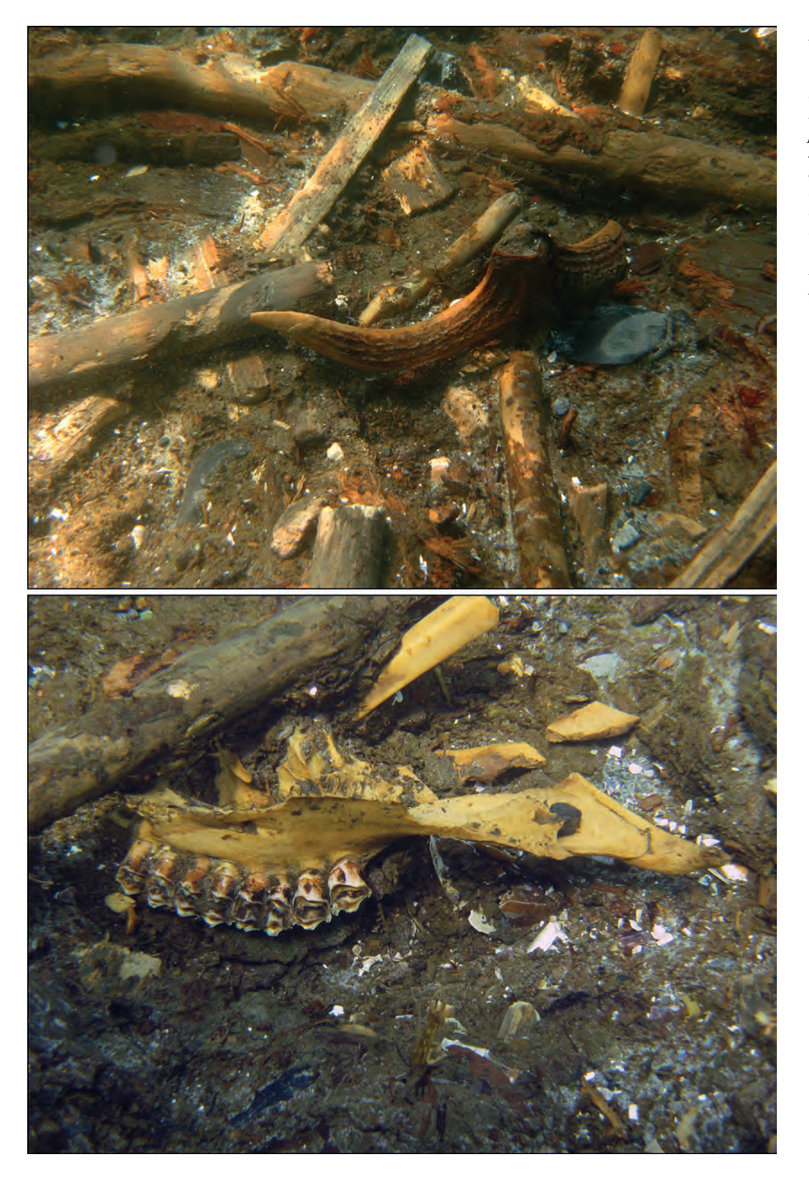
Figure 26.1: Occupation refuse deposited in shallow water off the Mesolithic coastal site of Tudse Hage, Denmark. Such permanently waterlogged sediments rich in detritus and deprived of oxygen often have excellent preservation of faunal and floral material