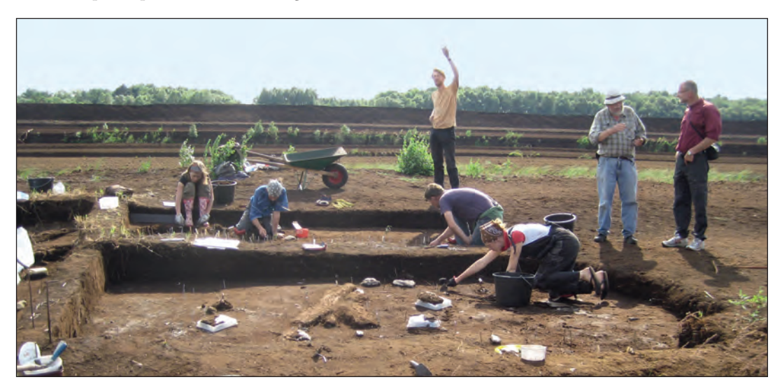
Figure 26.3: Excavating organic sediments on land is a recommended educational component for underwater archaeologists. Here an international group of students and young researchers are trained in excavating a Mesolithic habitation site in an artificially drained peat bog near Rönneholm, Sweden

Figure 26.2: Gathering and fishing are important parts of subsistence along the present-day coast of Zanzibar, East Africa. If the marine resources of these coasts were also exploited intensively during the Pleistocene, there is likely to be an abundance of interesting archaeology to be found on the continental shelf of this region – as in many other coastal locations worldwide that were populated by human migrants from Africa