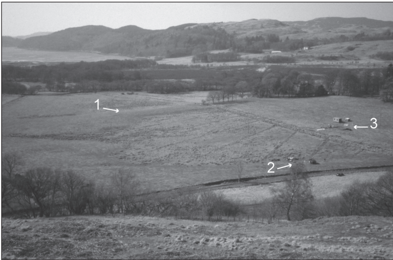
Figure 8.2: View of the Kilmore site (from the east): 1 – shingle spit, 2 – trench A, 3 – trench B

settlements were most likely to be found in areas within protected embayments, especially near the heads of the fjord-like inlets (sea lochs) that characterise the coast of central-west Scotland.