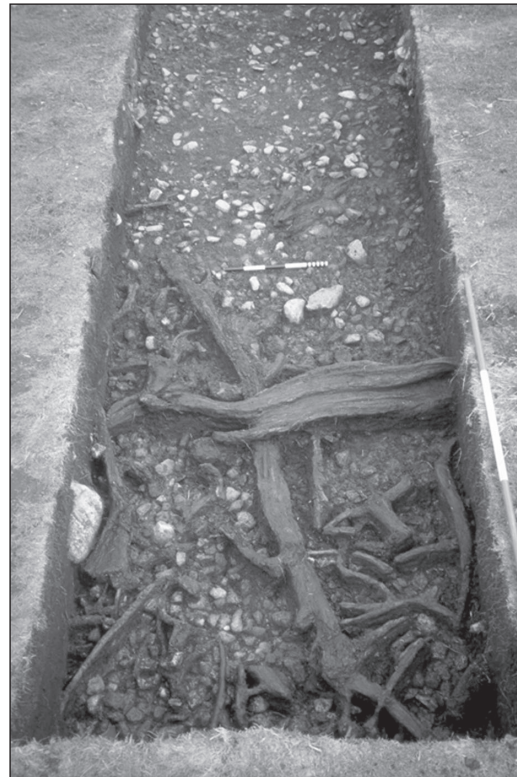
Figure 8.3: (far left) The Kilmore site: the buried A-horizon in Area A. The thin layer of stones which overlies the buried A-horizon at the lower end of the trench is interpreted as an anthropogenic feature