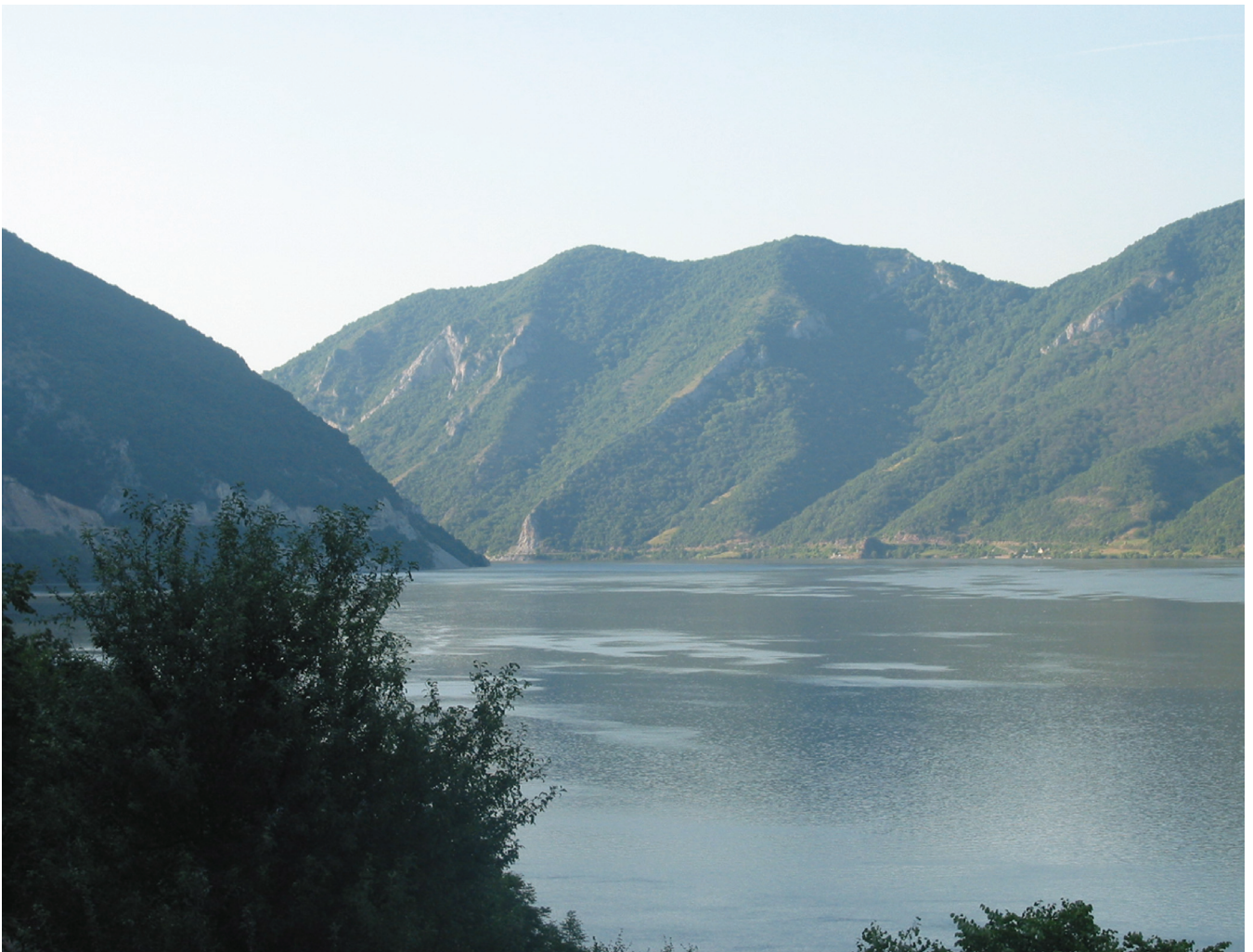
Figure 2. Two views of the Iron Gates gorge. Top: The gorge near the sites of Hajdučka Vodenica (Serbia) and Icoana (Romania); the photograph was taken from the Serbian bank looking upriver. Bottom: The gorge photographed from Lepenski Vir, looking upriver.

facts’ are “all stone implements worked by grinding/polishing, as well as unfinished examples with traces of flaking or pecking ... [and] ... implements that are naturally polished or polished through use” (Antonović, this volume: 19). Her analysis is restricted to sites on the Serbian bank of the Danube — proceeding downstream, Padina, Lepenski Vir, Vlasac, Hajdučka Vodenica, Ajmana,