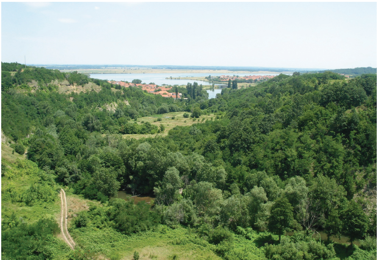
Figure 3. Two views of the ‘downstream area’ of the Iron Gates. Top: The Danube floodplain at Schela Cladovei (Romania), 8 km downstream from the Iron Gates I dam. The Schela Cladovei archaeological site extends for about a kilometre along the riverbank. The town of Kladovo in Serbia can be seen on the opposite bank of the Danube. Bottom: The confluence of the Zamna river with the Danube on the Serbian side, 8 km upstream from the Iron Gates II dam. Opposite the confluence lies Ostrovul Mare (The Big Island). Several Mesolithic sites were found in the vicinity — cf. Figure 3.