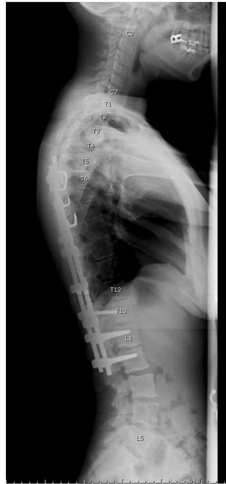
Fig. 2 Lateral radiograph of the same patient as in Fig. 1 confirms the extra thoracic level is present

Variations in the number of ribs or of lumbar vertebrae occur both in the general population and in patients with idiopathic scoliosis. However, this is the first study to show that these variations are associated with differences in the