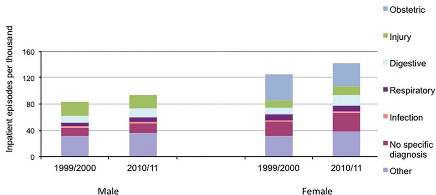
Figure 2 Adolescent inpatient episodes in England (1999/2000–2010/2011).

Although inpatient care represents a small proportion of health-care delivered to adolescents, avoiding unnecessary hospital admission has been identified as a key health priority by young people themselves, 16 and high-quality inpatient care is critical to