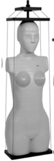
FIGURE 1: CIRS ATOM female phantom (Model number 702-D).

Amongst the various parameters which affect and account for the amount of radiation required during MDCTA examination are maximum body mass index (BMI), tube voltage (kVp), retrospective versus prospective image acquisition, volume scan length, heart rate (HR), and tube current time product (mAs) [10–17]. In addition, the effect of kVp variation on radiation dose depends on the type of CT scanner due to individualized internal scanner filtration and geometry. Also, results of kVp variations have generally been evaluated for the computed tomography dose index (CTDI) and/or CTDI water ( CTDI_w ) but not as they pertain to specific organ doses [10, 16]. Reduction of kVp from 135 to 120 or 120 to 100 during cardiac imaging has also been shown to produce adequate image quality [5].