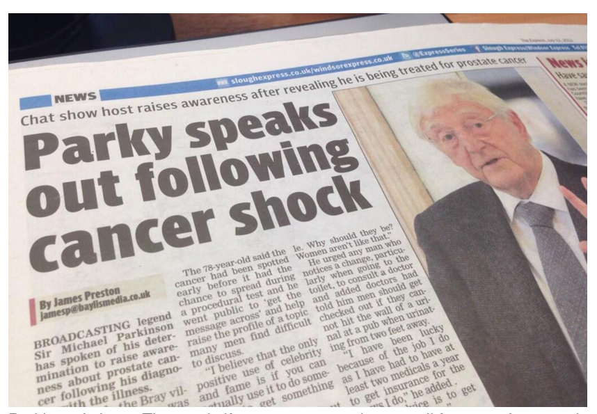
Parkinson's lore: "The test is if you can pee against a wall from two feet, you haven't got it"