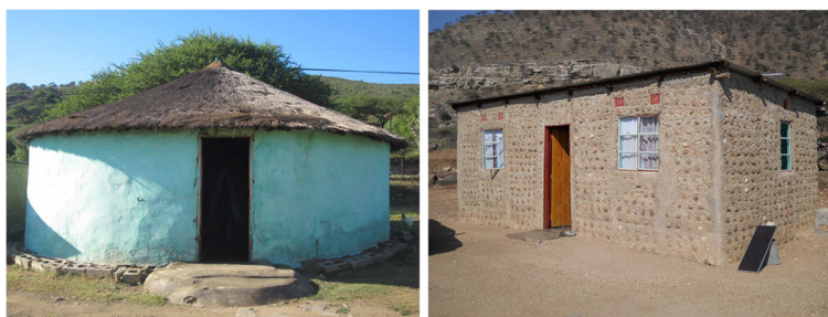
Figure 1 Two predominant types of traditional home construction in Tugela Ferry. A. Round-shaped home with thatched roof B. Box-shaped home with metal roof.

Two hundred eighteen ventilation measurements were conducted in 24 homes; 12 round-shaped huts with thatched roofs and 12 box-shaped homes with metal roofs (Figure 1). The structural and environmental characteristics of the homes are shown in Table 2. Compared to box-shaped, round homes had greater room volumes (91.3 m 3 vs. 36.6 m 3 , p < 0.001 ), were more likely to have cross-ventilation (10 vs. 2 homes,