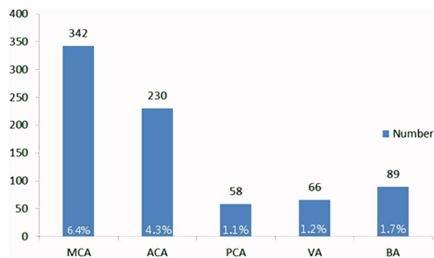
Figure 2. The number (percentages) of stenosis in each vessel segment. MCA: middle cerebral artery, ACA: anterior cerebral artery, PCA: posterior cerebral artery, VA: vertebral artery, BA: basal artery. doi:10.1371/journal.pone.0065229.g002

were lower with higher levels of non-HDL-C. A larger proportion of subjects with higher non-HDL-C levels were men, smokers and had concomitant hypertension and diabetes.