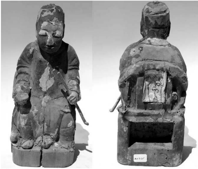
FIG. 1.—Front and back of Hunan statue (showing cavity).

commissioned the statue. If the names in this section of the consecration certificate are not of disciples of a particular religious master, then they are usually those of members of the same family and tend to include the names of the main patron (usually the father) and his wife, as well as of their sons (and their wives) and daughters. While many of the consecration certificates merely contain lists of names, some of them also contain short biographies. This may seem like a trivial point, but it is actually quite significant for those interested in genealogy, since in other historical documents women are hidden away—either through neglect or because they remain nameless. From one perspective, then, these images and their contents are what Michael Baxandall has termed “deposits of social relationships.” 46 The consecration certificate usually ends with the date of the consecration, the statue carver’s name, and in some cases a register of talismans (see fig. 2).