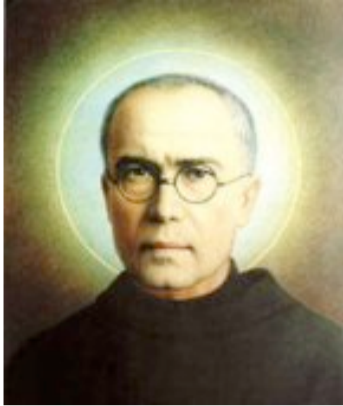
Fig. 5 Unidentified artist, Saint Maksymilian Kolbe , print after a painted image derived from a photograph, 1980s