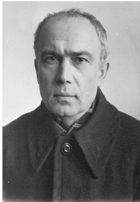
Fig. 4 Unidentified photographer, Father Maksymilian Kolbe , 1940