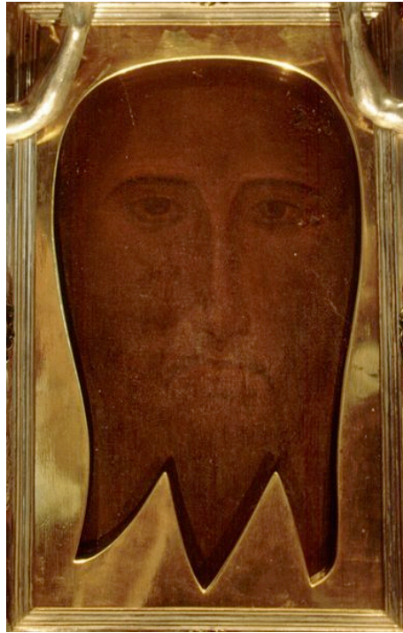
Fig. 1 The Mandylion of Edessa, Private Chapel of the Pope, Vatican