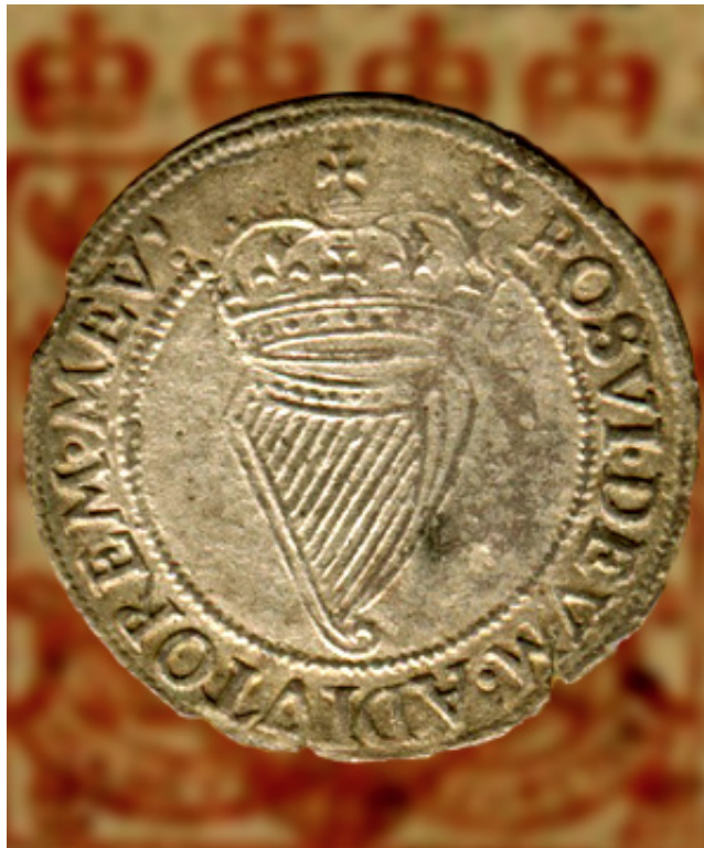
The Irish harp. More

When Elizabeth debased the Irish harp, she acted against a well-recognized baseline. Value, at the turn of the sixteenth century, was widely understood in a particular way: it was a real or tangible resource to be collected, controlled, and distributed by a sovereign. The character of money lay at the heart of that practice, with all its political and legal complexity, its material impact, and the conceptual categories that attended those dimensions. Through its medium, a particular approach to value penetrated the constitutional relations of mercantilism, the precapitalist belief that value was acquired not made.