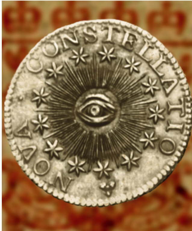
Nova Constellatio coin. Courtesy the Libraries of the University of Notre Dame. More information on their Website .

produced during the period before the Act of 1764: rough prints of surprising beauty, often bearing a provincial symbol—the pine tree or the fox, a snake, sailing ship, or colony seal, edged with garlands or a scrolled pattern.